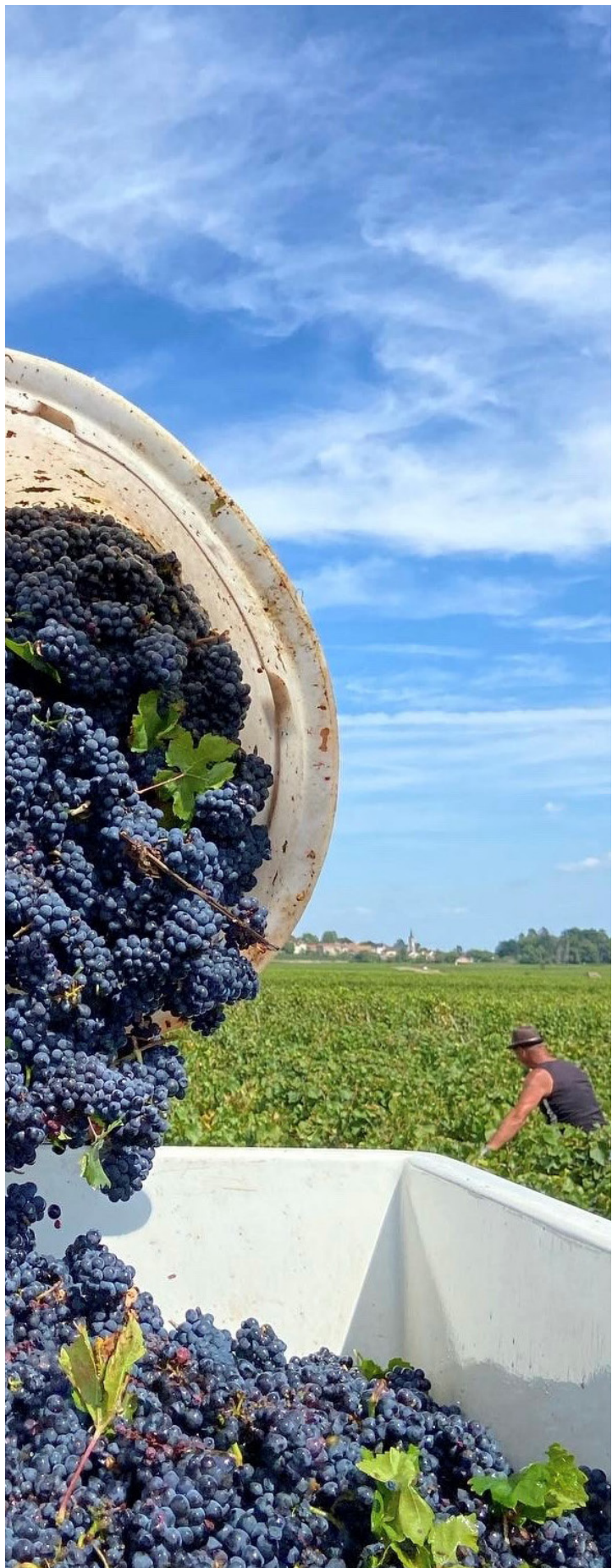
SAVIGNY CHAMP-CHEVREY MONOPOLE - DOMAINE TOLLLOT-BEAUT