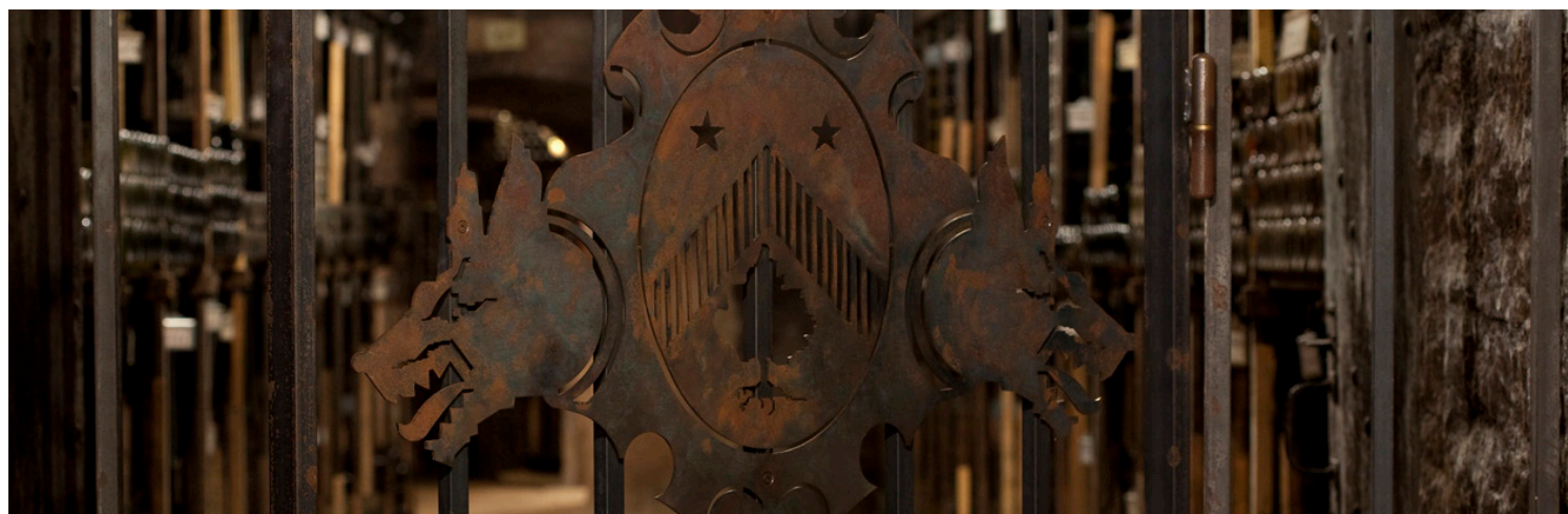
DOMAINE BOUCHARD PÈRE ET FILS