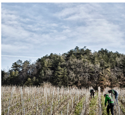
DOMAINE WILLIAM FÈVRE