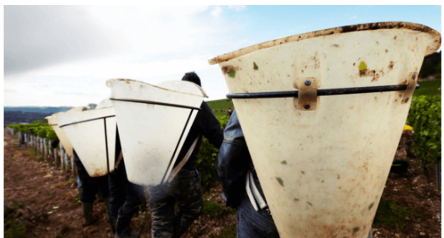
DOMAINE LOUIS MICHEL & FILS