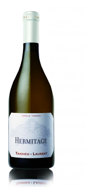
Hermitage 2021, Tardieu-Laurent

A blend of 80% Marsanne and 20% Roussanne from 40-50 year old vines across the four separate lieux-dits of Beaume, Pierrelles, Murets and La Croix.