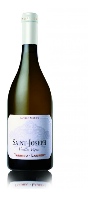
Saint Joseph 'Vieilles Vignes' 2022, Tardieu-Laurent

Made from 85% Marsanne and 15% Roussanne with 1/3rd of the wine coming from the southern part of the appellation around Mauves and 2/3rds from Chavanay and St. Pierre de Boeuf in the northern part.