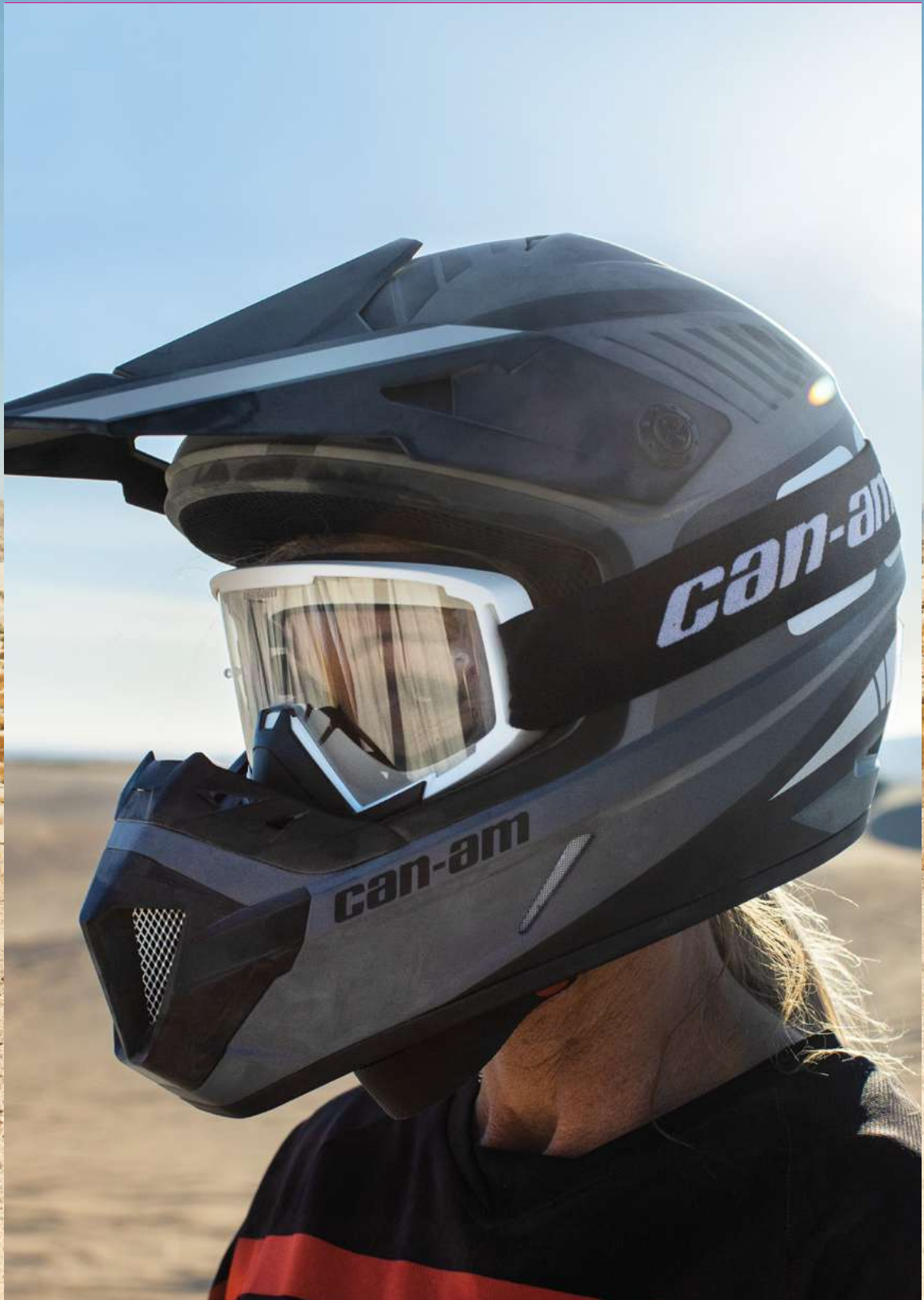
CORRY WELLER CAN-AM PRO RIDER