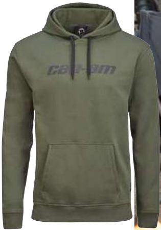
CAN-AM SIGNATURE PULLOVER HOODIE Available in Army Green & Heather Charcoal 454516