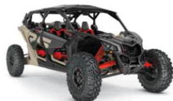
X rs with Smart-Shox ● Turbo RR ● Turbo RR ● Turbo RR