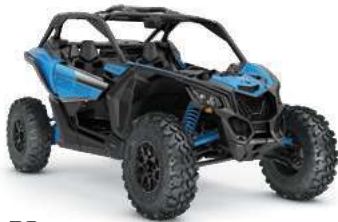
DS ● Turbo Turbo RR ● Turbo Turbo RR ● Turbo Turbo RR