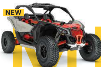
NEW X rc 64" ● Turbo RR