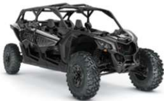
X ds ● Turbo RR ● Turbo RR