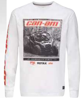
SANDER LONG-SLEEVE T-SHIRT Available in Blue & White 454477