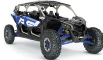
X rs ● Turbo RR ● Turbo RR ● Turbo RR