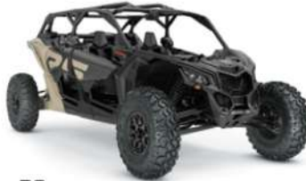
RS ● Turbo RR ● Turbo RR ● Turbo RR