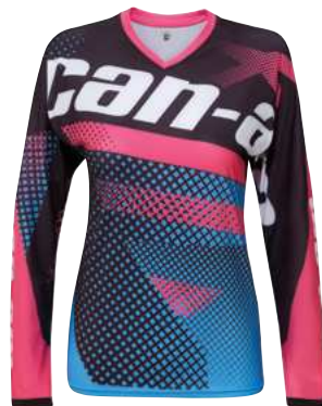
X-FACTOR JERSEY LADIES Available in Pink 454427