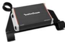
CAN-AM AMPLIFIER KIT X3 715007227