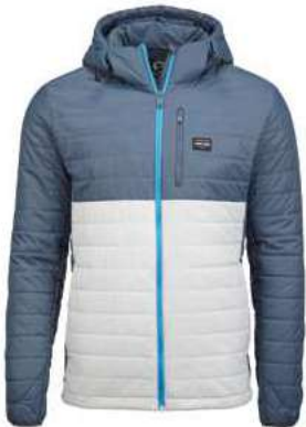
VECTOR INSULATOR PUFFER JACKET Available in Black & Blue 454436

T-SHIRTS, SWEATERS, CAPS, JACKETS AND MORE. GET THE BEST CAN-AM APPAREL FOR LIVING YOUR BEST OFF-ROAD LIFE.