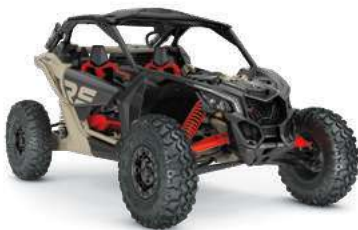
X rs ● Turbo RR ● Turbo RR ● Turbo RR