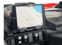
ELECTRONIC DEVICE HOLDER X3 715002874 MTS 715005212