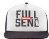
SANDER MESH FLAT CAP Available in Khaki & White 448693