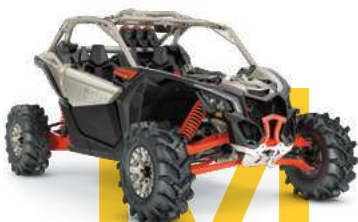
X mr 72" ● Turbo RR