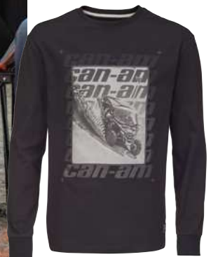
UNDISPUTED LONG-SLEEVE T-SHIRT Available in Black & Heather Grey 454432

T-SHIRTS, SWEATERS, CAPS, JACKETS AND MORE. GET THE BEST CAN-AM APPAREL FOR LIVING YOUR BEST OFF-ROAD LIFE.