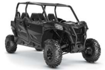
MAX DPS ● 1000R