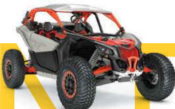
X rc 72" ● Turbo RR