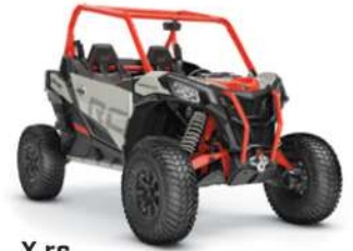
X rc ● 1000R