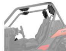
COMPLETE WET SOUNDS AUDIO SYSTEM MTS 715003672