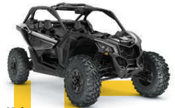
X ds ● Turbo RR ● Turbo RR