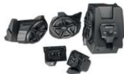
COMPLETE MTX AUDIO SYSTEM X3 715002873