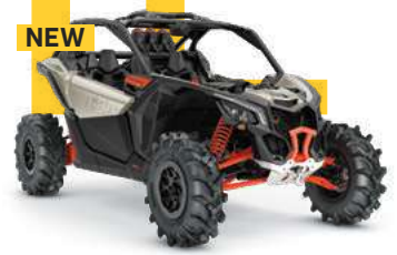
NEW X mr 64" ● Turbo RR