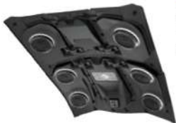
CAN-AM AUDIO ROOF MAX X3 715006709