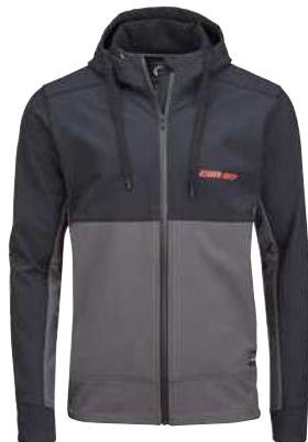
BLOCKADE SOFTSHELL Available in Black & Blue 454442