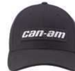
CURVED CAP PATCH Available in Black & Navy 454433