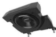
CAN-AM SUBWOOFER X3 715004956 MTS 715006359