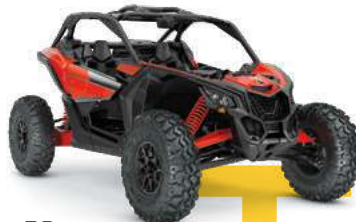
RS ● Turbo RR ● Turbo RR ● Turbo RR