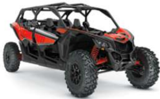
DS ● Turbo Turbo RR ● Turbo Turbo RR ● Turbo Turbo RR