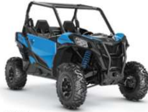
DPS ● 1000R ● 1000R