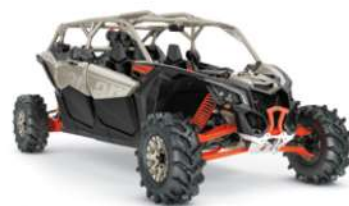
X mr ● Turbo RR

THIS LINEUP IS WIDE OPEN AND THERE FOR THE TAKING.