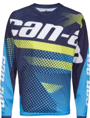
① X-FACTOR JERSEY Available in Blue, Grey & Yellow 454437

Available in Black, Blue, Pink & Red 446329