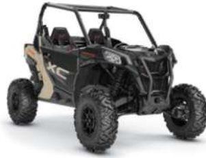
X xc ● 1000R