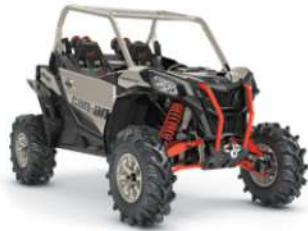
X mr ● 1000R