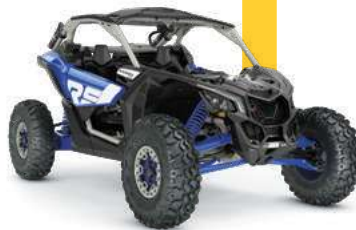
X rs with Smart-Shox ● Turbo RR ● Turbo RR ● Turbo RR