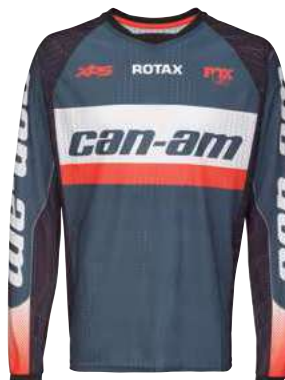
ZULU JERSEY Available in Black & Blue 454426