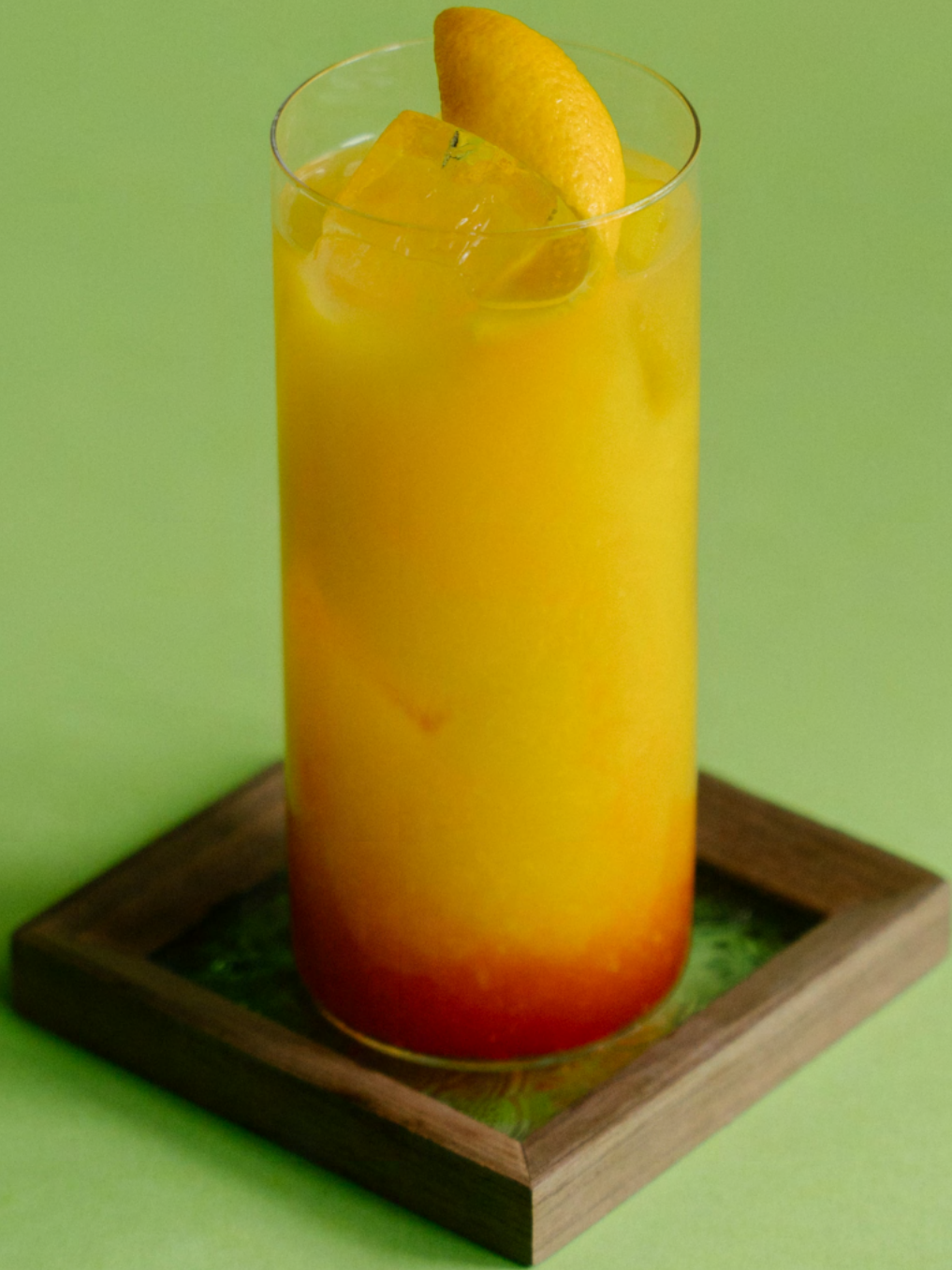
CAMPARI ORANGE CAMPARI / ORANGE JUICE