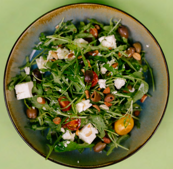
菲達芝士火箭菜沙律 FETA CHEESE ROCKET SALAD