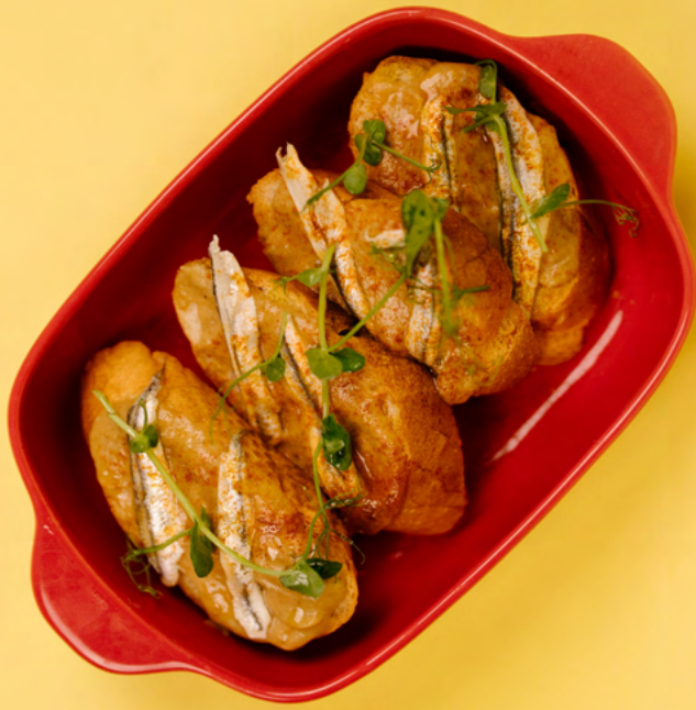
白鯧魚茄子蓉多士 BRUSCHETTA W/ EGGPLANT PURÉE