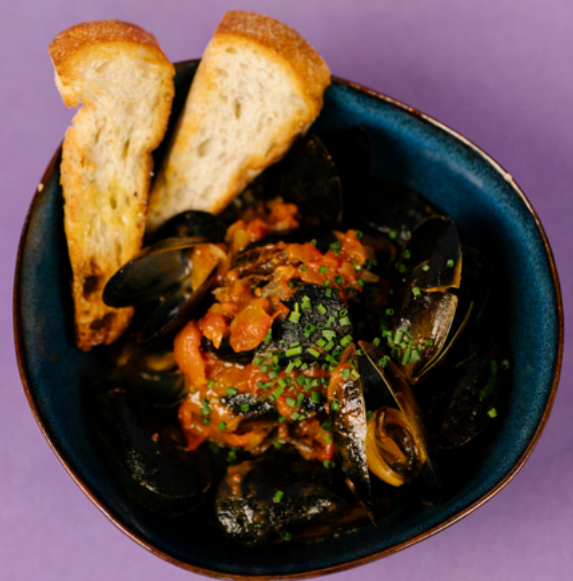
新鮮青口配辣蕃茄汁 FRESH MUSSEL W/ SPICY TOMATO SAUCE