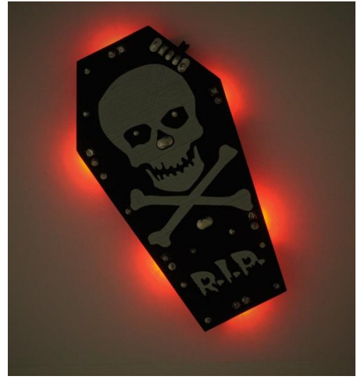
Front of board: