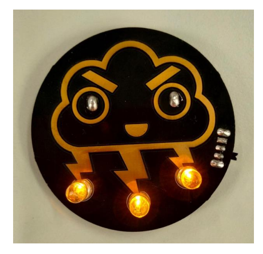
San Luis Obispo, CA