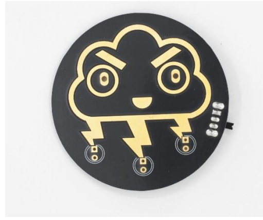
Front of board with switch:

1. Solder Right-angle Switch Note: Be careful not to bridge the pads