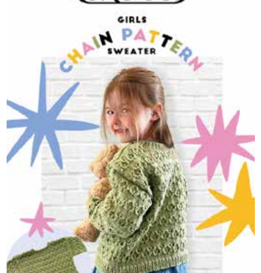
Design 2315 $8.90 Knitted in Shade 170 Pistachio