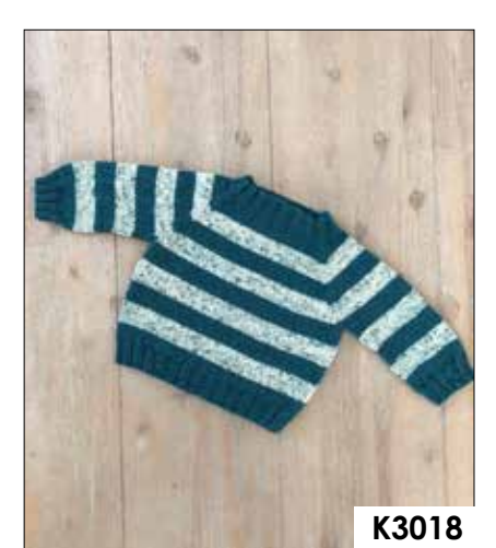
PATTERNS $8.20 Ea (Meia & Meia Print)