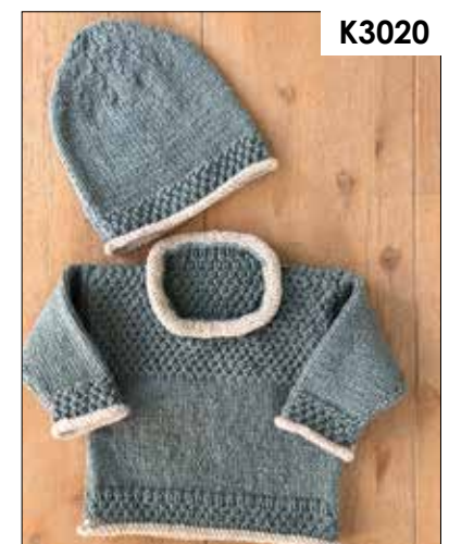
PATTERNS $8.20 Ea