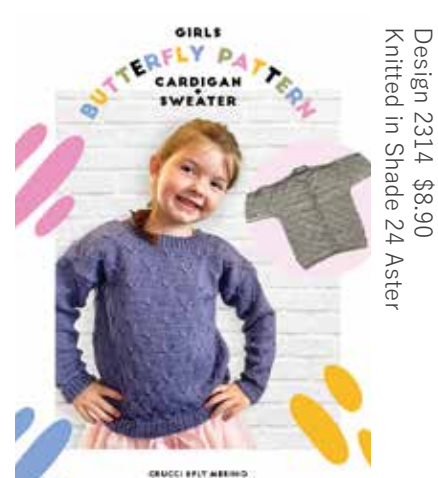
Average Length 100m 22 sts x 30 rows on 4mm needles = 10 \times 10 cm

stitch definition durability ease of care