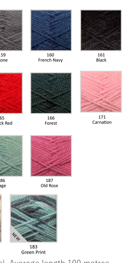
100% Pure Machine Washable Wool Average length 100 metres 22 sts x 30 rows on 4mm needles = 10 \times 10 cm