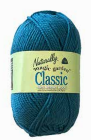
PATTERNS $8.20 Ea