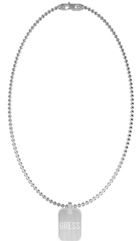
JUMN01 355JW ST T/U $99.95 26" BALL CHAIN & LOGO TAG STL