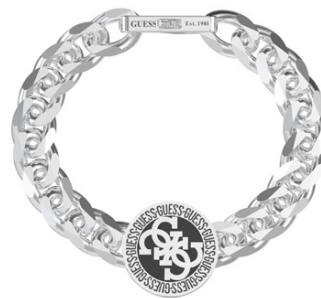
JUMB02 114JW STBK L $79.95 CURB & 21MM BLACK 4G ST