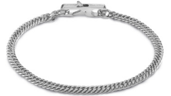
JUMB01 330JW ST L $79.95 GRUMETTA DOPPIA 5MM STL