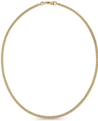
JUMN01 329JW YG T/U $99.95 21" GRUMETTA DOPPIA 5MM YG