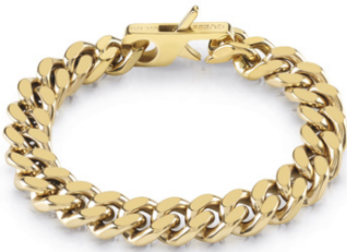
JUMB01 350JW YG S $99.95 4DC CURB CHAIN 11MM YG