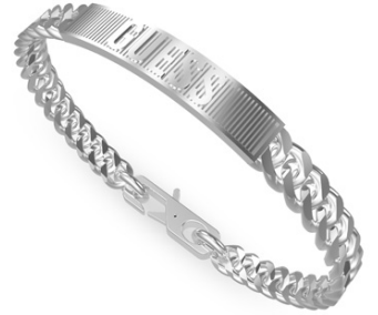
JUMB01 356JW ST L $79.95 2DC CURB CHAIN & LOGO TAG STL