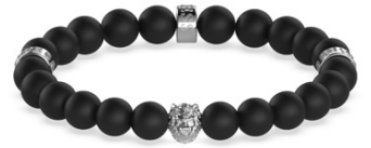
JUMB01 303JW ST T/U $79.95 BLACK BEADS & 12MM LION STL