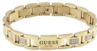
JUMB01 342JW YG T/U $129.95 12MM FLAT CHAIN & WHITE CZ YG