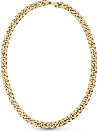
JUMN01 349JW YG T/U $119.95 23" 4DC CURB CHAIN 11MM YG