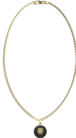
JUMN01 316JW YGYB T/U $99.95 21" COIN 20MM & BLACK YG