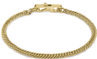
JUMB01 330JW YG L $79.95 GRUMETTA DOPPIA 5MM YG