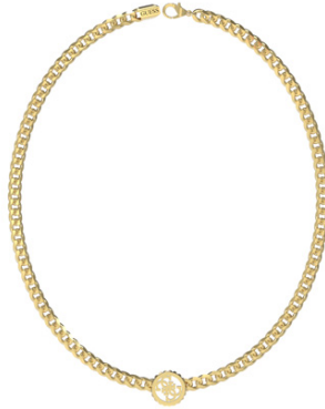
JUMN02 100JW YG T/U $99.95 21" CHAIN & 16MM 4G COIN YG