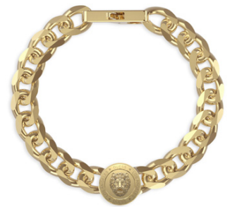
JUMB01 309JW YG L $79.95 14MM LION COIN YG