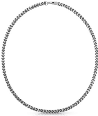
JUMN01 337JW ST T/U $99.95 21" FOXTAIL CHAIN 5MM STL