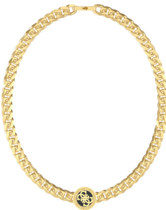
JUMN02 112JW YGBK T/U $99.95 21" CHAIN & 21MM BLACK 4G YG