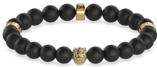
JUMB01 303JW YG T/U $79.95 BLACK BEADS & 12MM LION YG