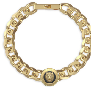
JUMB01 309JW YGBK S $79.95 14MM LION COIN & BLACK YG