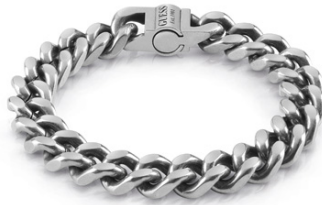
JUMB01 350JW AS S $99.95 4DC CURB CHAIN 11MM AS