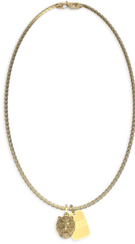
JUMN01 300JW YG T/U $119.95 26" GUESS TAG & 20MM LION YG