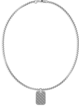
JUMN01 359JW ST T/U $99.95 26" BOX CHAIN & 4G TAG STL