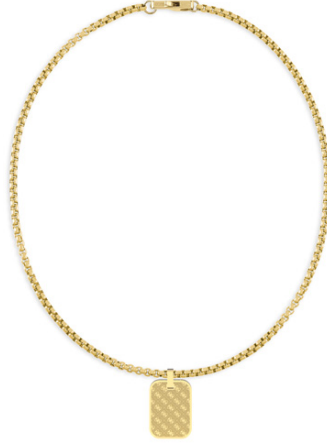
JUMN01 359JW YG T/U $99.95 26" BOX CHAIN & 4G TAG YG