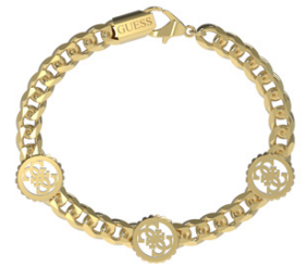
JUMB02 101JW YG L $119.95 CHAIN & 11MM TRIPLE 4G COIN YG