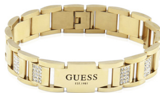
JUMB01 341JW YG T/U $139.95 15MM FLAT CHAIN & WHITE CZ YG