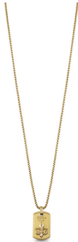
JUMN01 324JW AG T/U $79.95 28" BOX CHAIN & TAG GIGLIO AYG