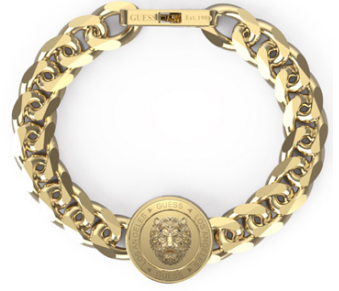
JUMB01 309JW YG S $79.95 14MM LION COIN YG