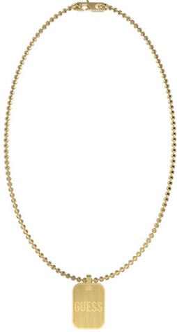
JUMN01 355JW YG T/U $99.95 26" BALL CHAIN & LOGO TAG YG