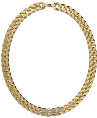
JUMN01 379JW YG T/U $199.95 23" CURB CHAIN & WHITE CZ YG