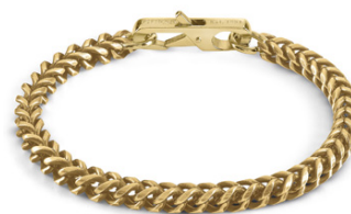
JUMB01 338JW YG L $79.95 BLACK & GOLD CHAIN YG