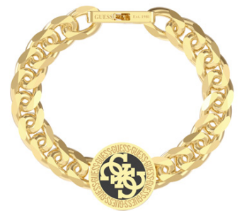
JUMB02 114JW YGBK L $79.95 CURB & 21MM BLACK 4G YG