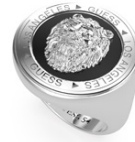
JUMR01 315JW YGBK 64 $69.95 21MM LION COIN RING & BLACK YG