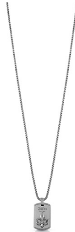
JUMN01 324JW AS T/U $79.95 28" BOX CHAIN & TAG GIGLIO AS