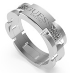
JUMR01 344JW GM 62 $79.95 FLAT RING & BLACK CZ GM