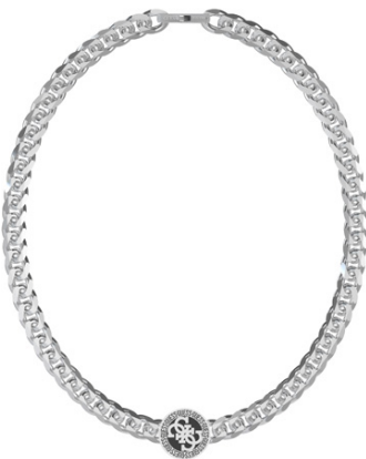
JUMN02 112JW STBK T/U $99.95 21" CHAIN & 21MM BLACK 4G ST