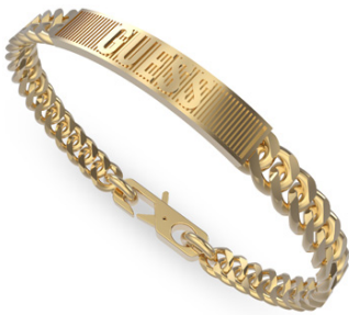
JUMB01 356JW YG L $79.95 2DC CURB CHAIN & LOGO TAG YG