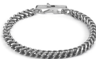
JUMB01 338JW ST L $79.95 BLACK & STEEL CHAIN STL