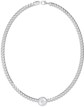
JUMN02 100JW ST T/U $99.95 21" CHAIN & 16MM 4G COIN ST