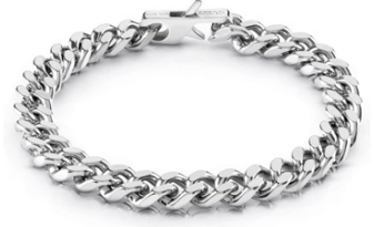
JUMB01 350JW ST L $99.95 4DC CURB CHAIN 11MM STL