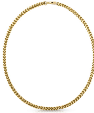
JUMN01 337JW YG T/U $99.95 21" FOXTAIL CHAIN 5MM YG