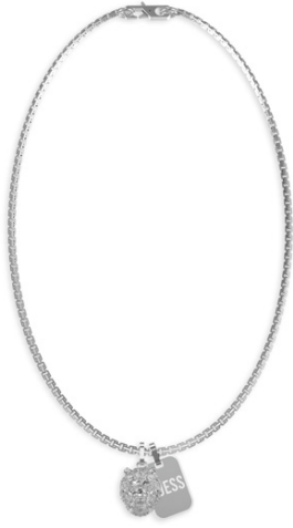
JUMN01 300JW ST T/U $119.95 26" GUESS TAG & 20MM LION STL