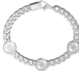
JUMB02 101JW ST L $119.95 CHAIN & 11MM TRIPLE 4G COIN ST