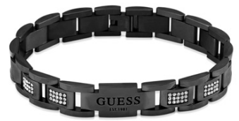
JUMB01 342JW GM T/U $129.95 12MM FLAT CHAIN & WHITE CZ GM