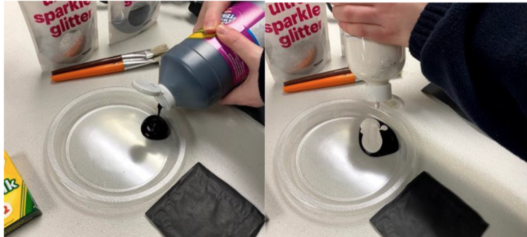
Step 1: Mix black and white paint on a paper plate.