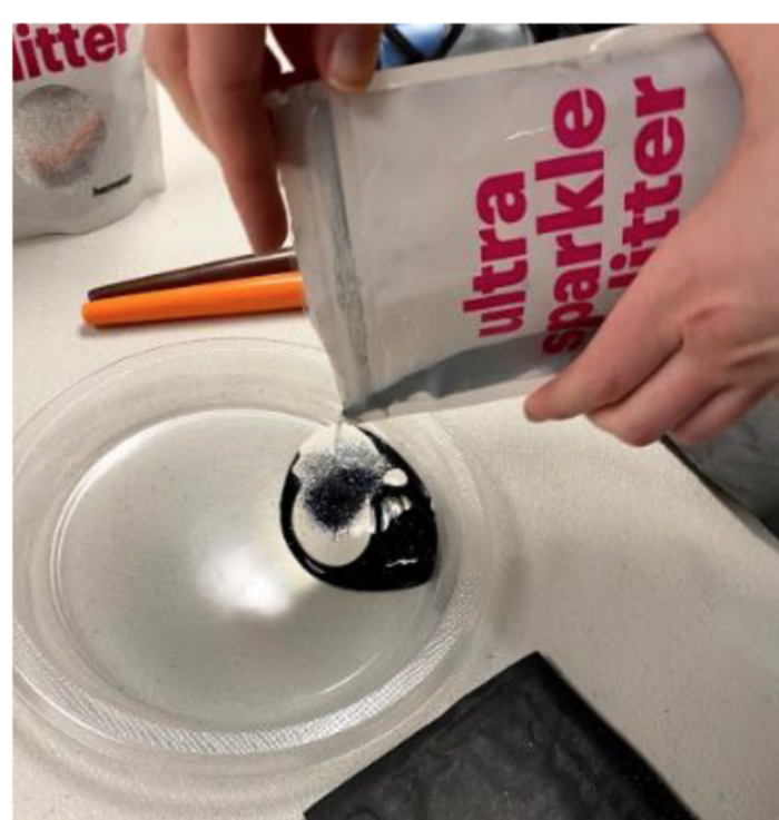
Step 2: Add glitter to your paint.