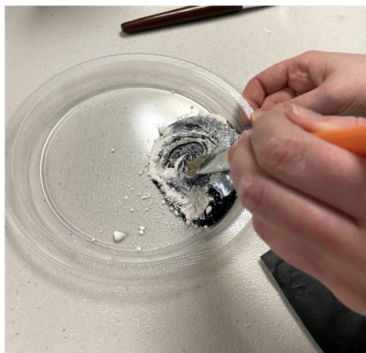
Step 5: Mix together chalk, paint and glitter to create your lunar paint.