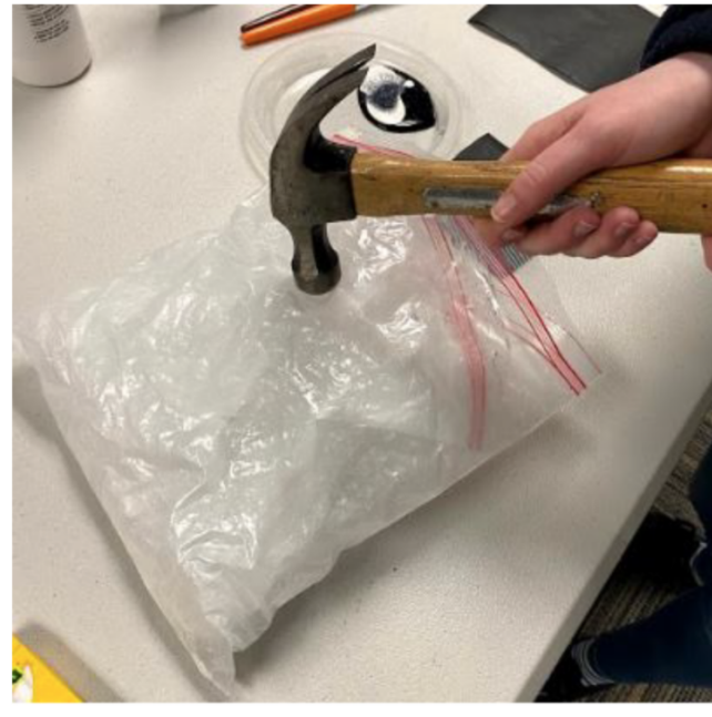
Step 3: (ADULT REQUIRED) Place white chalk into the ziploc bag. Hammer until chalk is crushed.