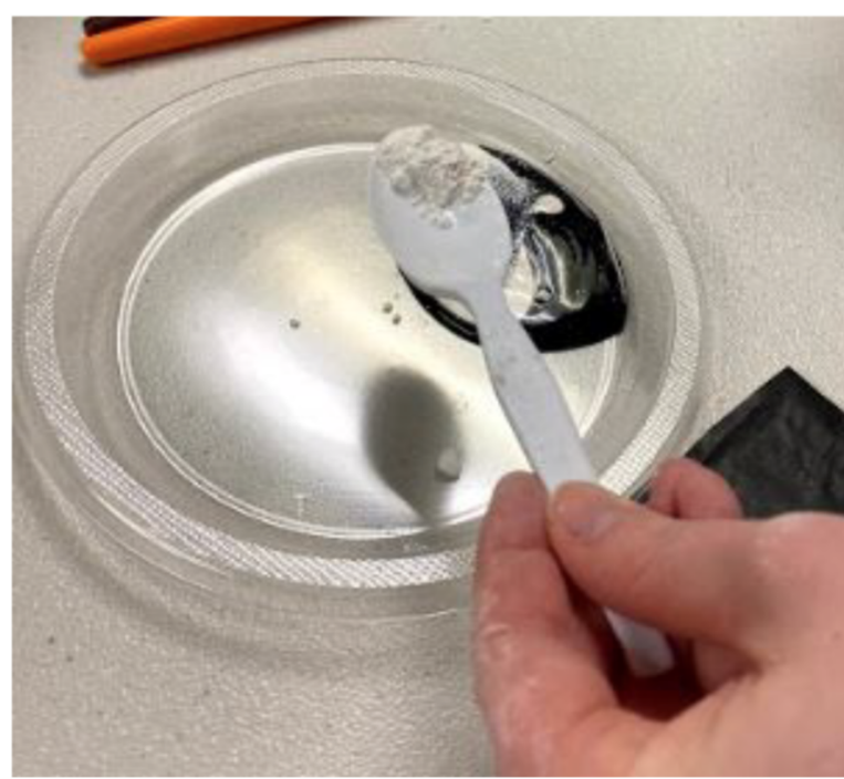
Step 4: Add chalk to your paint to create texture.