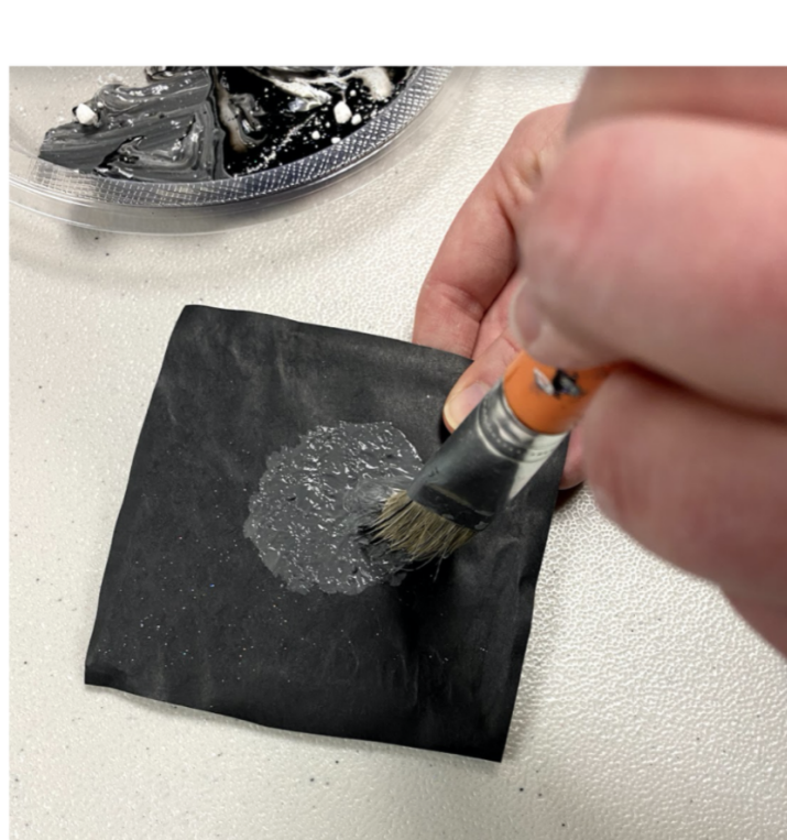
Step 6: Dap paint onto the black surface you've created. Wait for it to dry or use a hair dryer.