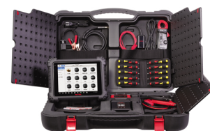
MS909CV Kit includes tablet, VCI, B200, Current Clamp & Multimeter