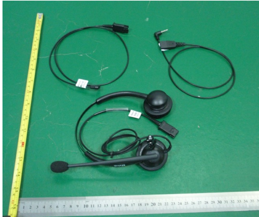
Fig. 1 Overview