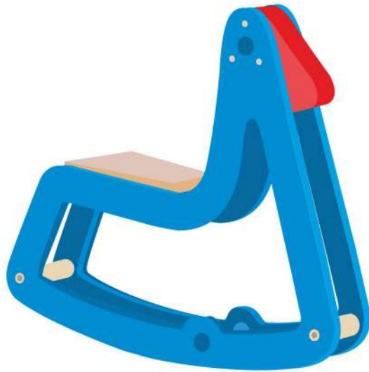
Horse Frame 1 No.