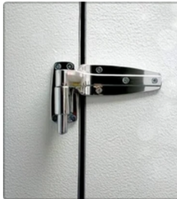
Kason 1248 Hinge