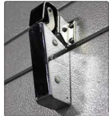
Kason 1094 Door Closer