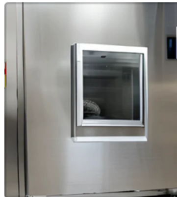
14 in x 14 in Window