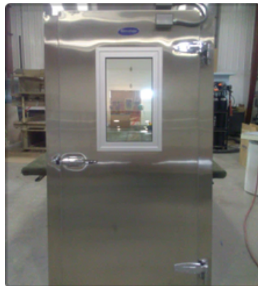
14 in x 24 in Window