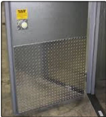
Dimond Kick Plate In/Out