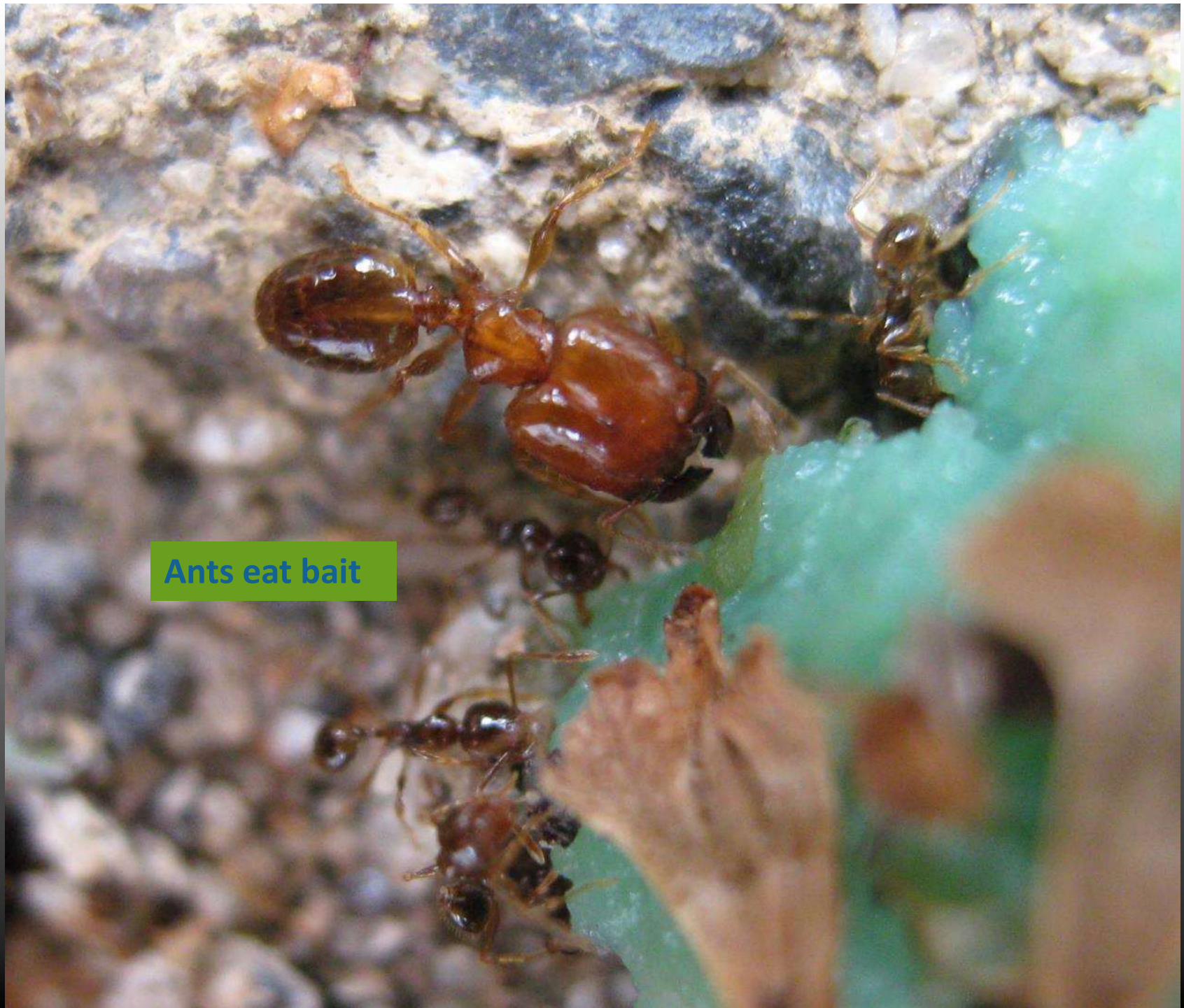
Ants eat bait