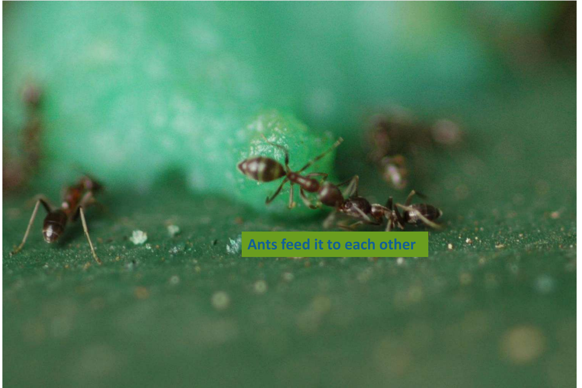
Ants feed it to each other