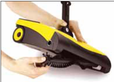
Changeable roller brush Requires no tools and allows hairs, threads, etc. to be removed quickly and easily