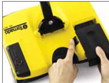
Easily installed battery Changing batteries is a breeze