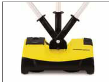
Flexible, universal joint Handle articulates, providing superior maneuverability