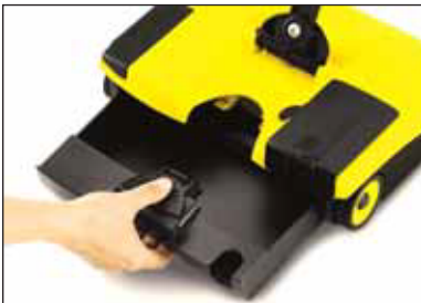
Easy to remove dustpan Provides convenient rear access with large capacity