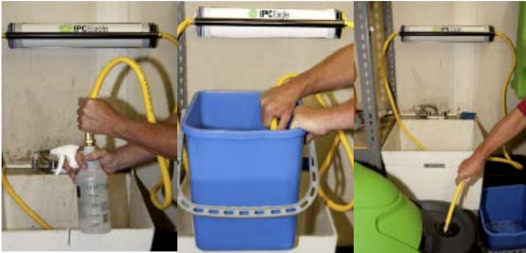
Ready Pure filling spray bottle

Kit includes: DI cartridge, DI holder frame, wall mount screws and a magnetic TDS meter