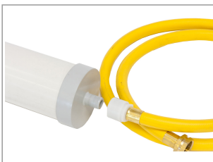
DOUBLE O RING CREATES PERFECT SEAL