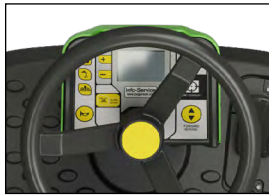
PRESET WORKING PROGRAMS