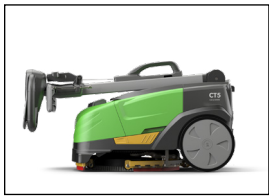
FOLDABLE HANDLE FOR STORAGE AND TRANSPORTING