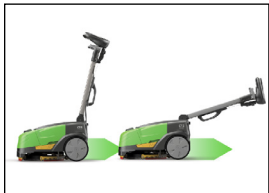
REVERSE DRYING SYSTEM