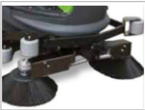
PRE-SWEEP SYSTEM ON CYLINDRICAL MODEL