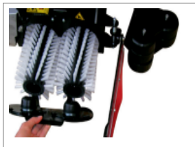
COMBINED SCRUBBING-SWEEPING SYSTEM THAT INCLUDES DEBRIS HOPPER ON CYLINDRICAL