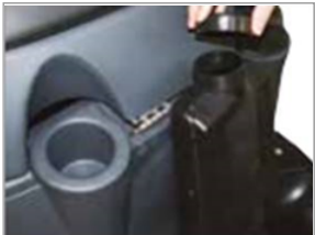
OPTIONAL DETERGENT DOSING SYSTEM