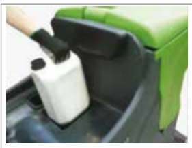
INTEGRATED CHEM DOSE