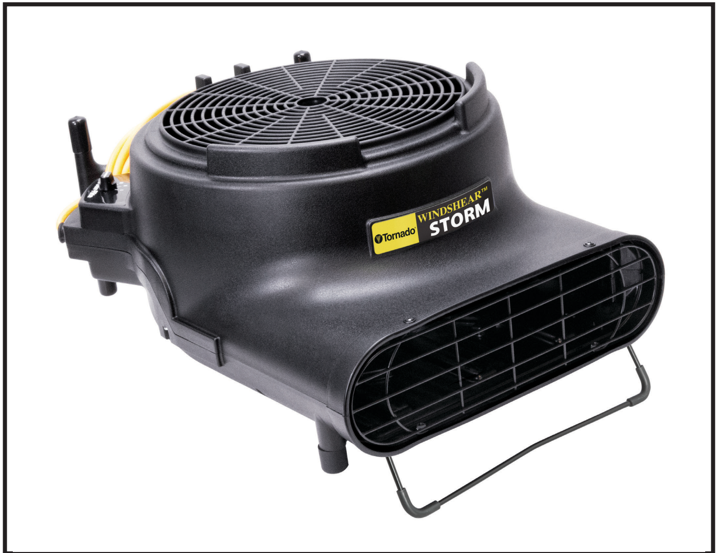
WINDSHEAR™ STORM DELUXE MODEL NO: 98780