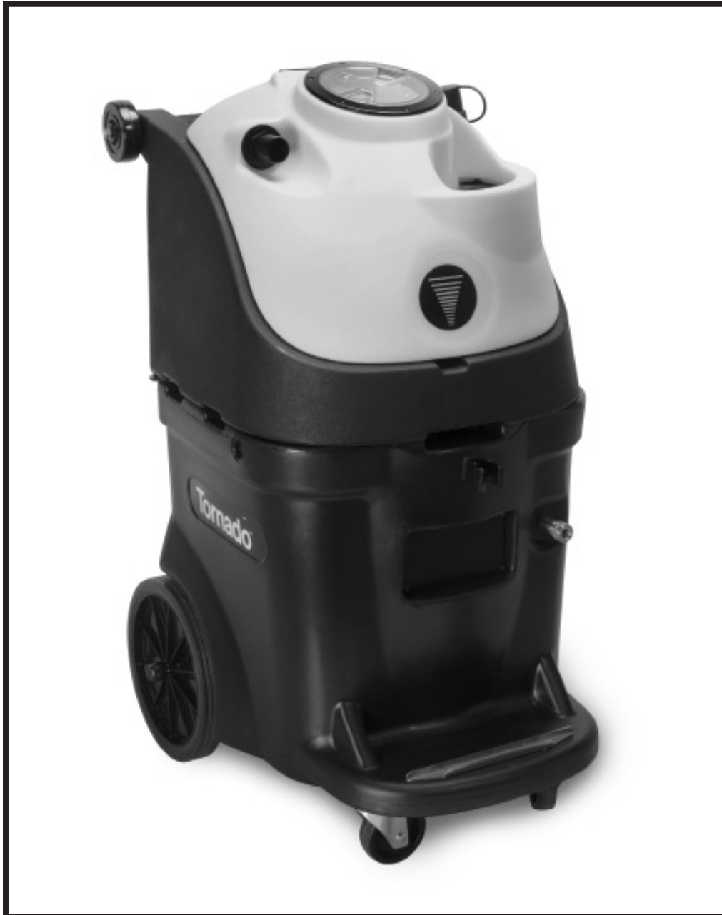
MARATHON UPRIGHT EXTRACTOR MODEL NO: 98250/98252H/98255PH

Operations & Maintenance Manual For Commercial Use Only