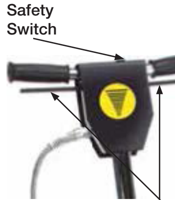
Figure #3 Switch Trigger

First, install the pad driver and pad, brush, or other attachment to be used. Plug the machine in as directed and lower the handle to the desired operating height and lock in place using the cam lever handle. Push the safety switch forward (see figure #3) and squeeze the switch triggers beneath the handle grips. This activates the motor and starts the block, brush or attachment in operation. Each time you release the triggers the safety switch will reset. You will need to follow the direction above to restart the machine. CAUTION: When leaving the machine unattended, disconnect the wall plug and return the handle to the “locked” upright position to prevent accidental starting.