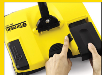
EASILY INSTALLED BATTERY Changing batteries is a breeze