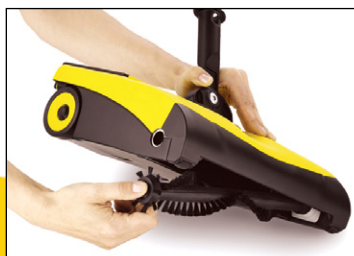
CHANGEABLE ROLLER BRUSH Requires no tools and allows hairs, threads, etc. to be removed quickly and easily