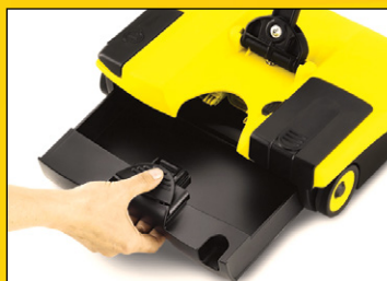
EASY TO REMOVE DUSTPAN Provides convenient rear access with large capacity