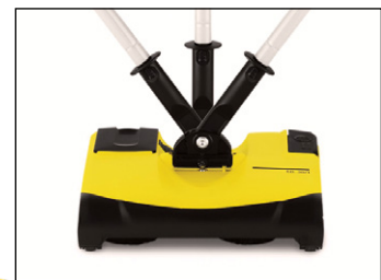
FLEXIBLE, UNIVERSAL JOINT Handle articulates, providing superior maneuverability