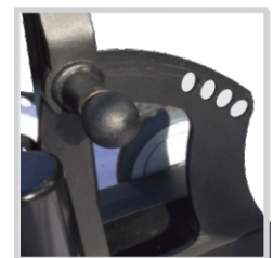
Exclusive Pin-Set™ Handle Lock - 4 Height