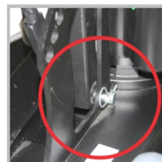
Remove the Handle Mounting Pin w/o Tools