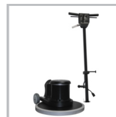
Remove/Install the Handle in 60 Seconds