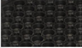
#635 General purpose rubber