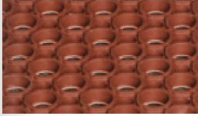
#636 Nitrile rubber blend terra cotta