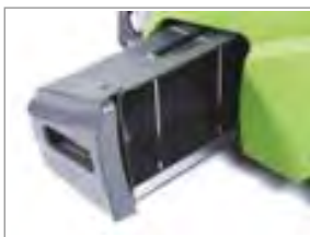
FRONTAL WASTE TRAY