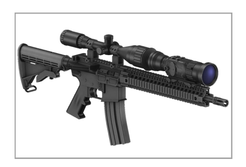
Clip-On (In-Line) Sight

Clip-On Adapter Required, Scope Adapter Optional (Configuration-Dependent)