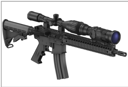
Clip-On (In-Line) Sight

Every TI-GEAR-C675 Clip-On Sight can be used in 3 main configurations