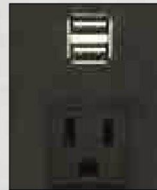
POWER DOCKING SYSTEM