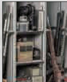
ADJUSTABLE INTERIOR OPTIONS