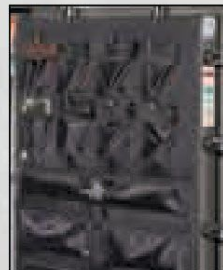
ACCESSORY DOOR ORGANIZER