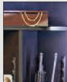
BRIGHT WHITE LED LIGHT KIT