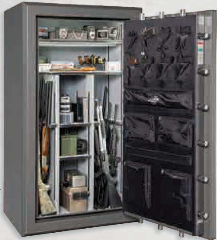
Treasury 48 in Gunmetal