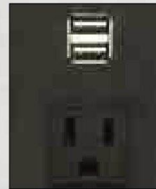
POWER DOCKING SYSTEM