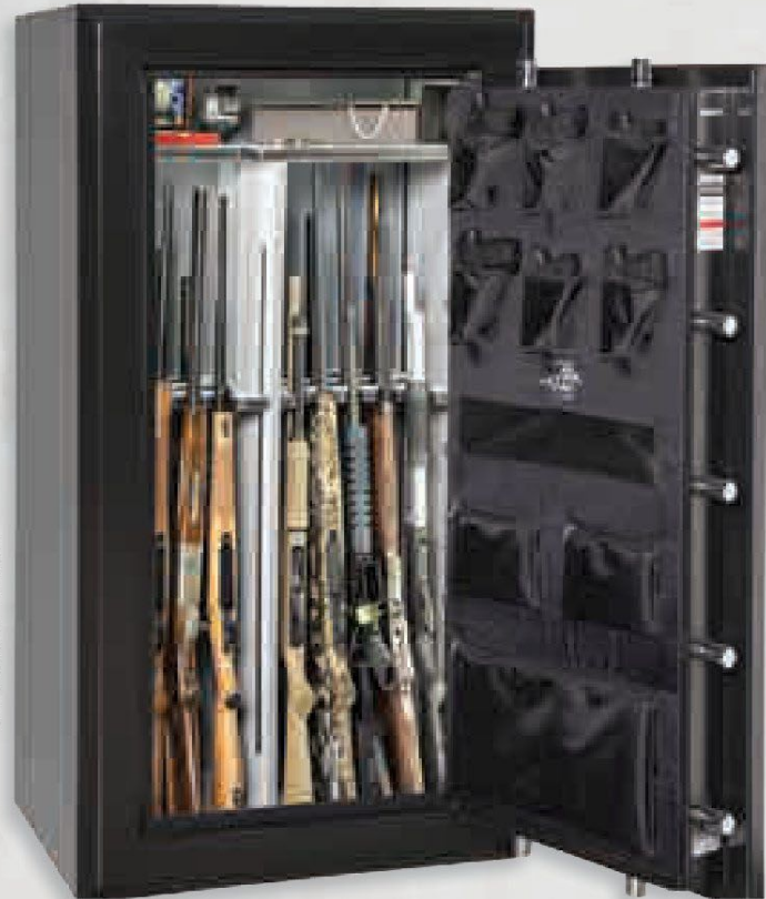
Silverado 51 in Black