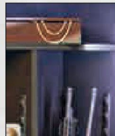
BRIGHT WHITE LED LIGHT KIT