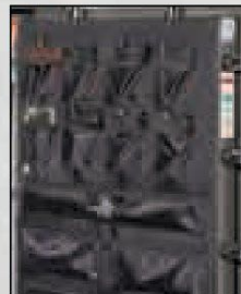
ACCESSORY DOOR ORGANIZER