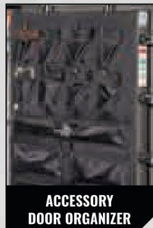
ACCESSORY DOOR ORGANIZER