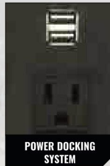
POWER DOCKING SYSTEM