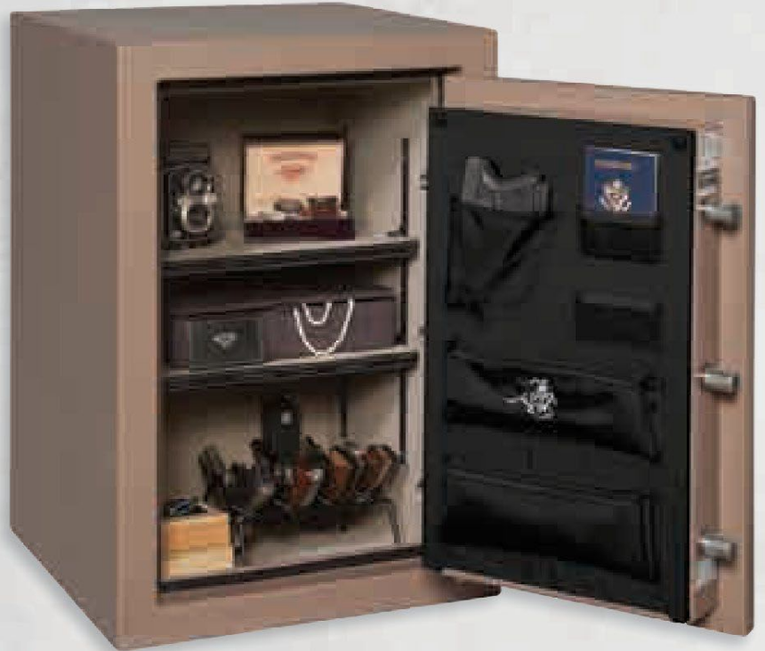
Home 7 in Sandstone