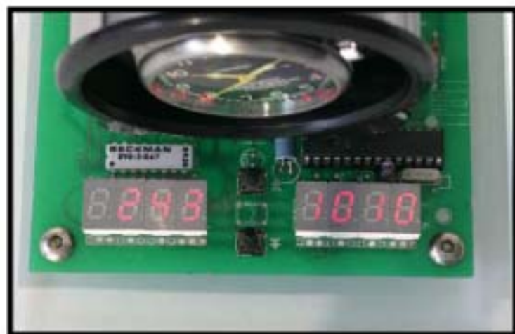
Detail of displays

Before you mount your watch, plug the supplied AC/DC adapter into any convenient wall outlet. It is suitable for use with any voltage from 100VAC to 240VAC and frequency of 50 or 60 hertz. Then, plug the cord end into the input jack at the rear of the winder. The left-hand display will then read "F10" and the right-hand display will read "01". After a five (5) second delay, the left hand display will shut off and the right-hand display will begin flashing. Now you can set the time using the buttons located in-between the digital displays. Be sure to set the clock for either AM or PM (for 24 hour time, see "Optional Settings"). Repeat the procedure for multiple units.