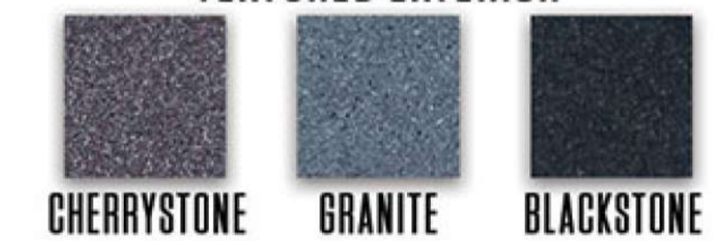
CHERRYSTONE GRANITE BLACKSTONE