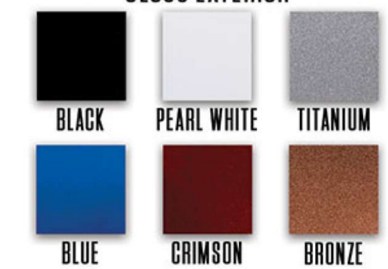
BLACK PEARL WHITE TITANIUM BLUE CRIMSON BRONZE