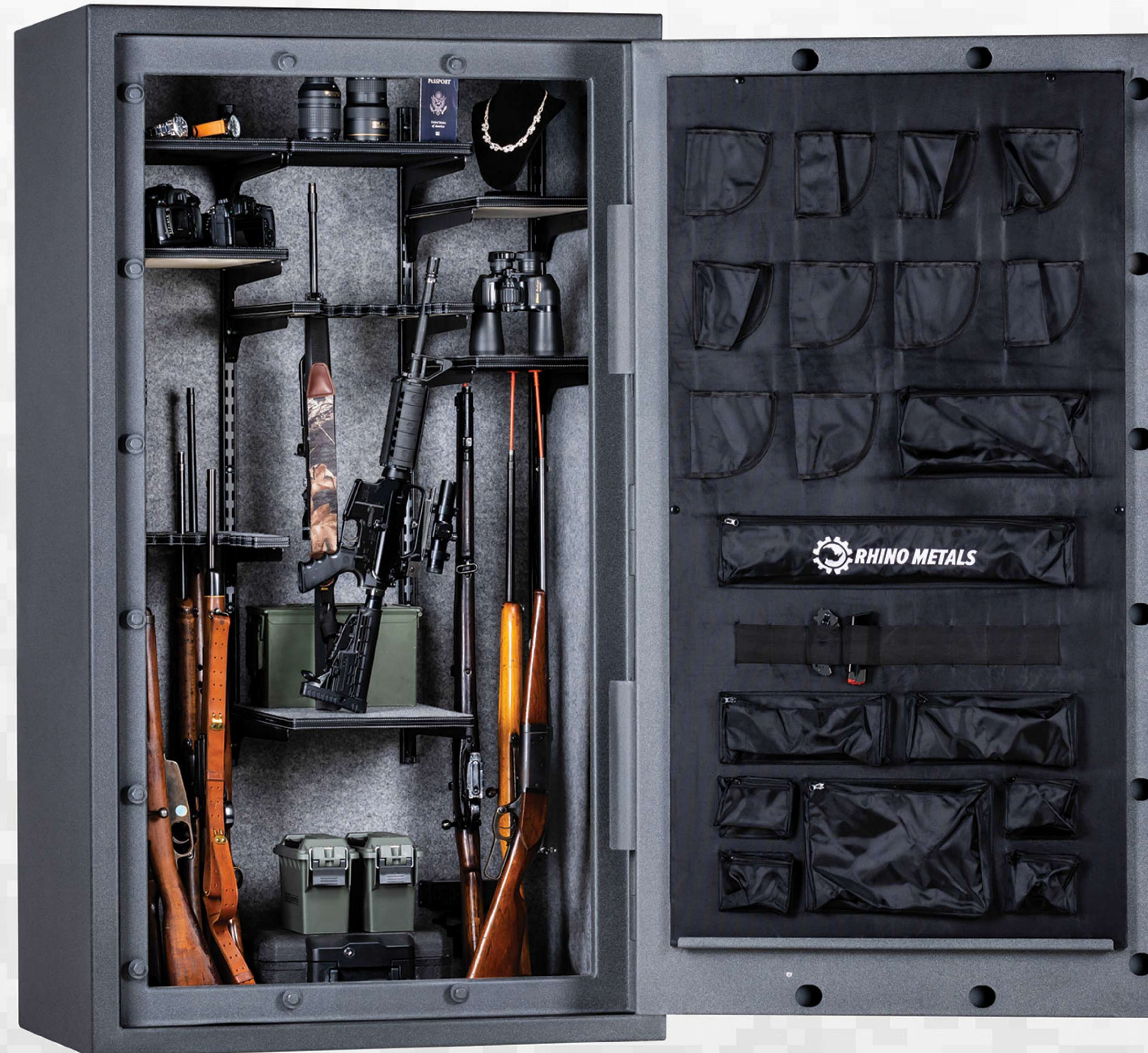
Model CX7241 in Granite Finish