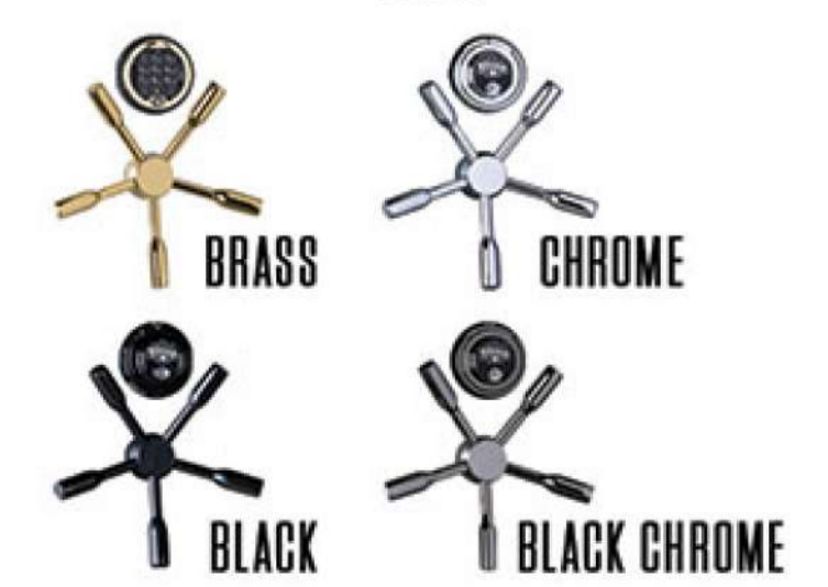
BRASS CHROME BLACK BLACK CHROME