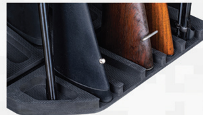
Flexible Cushioned Butt and Barrel Rests Help Protect From Damage