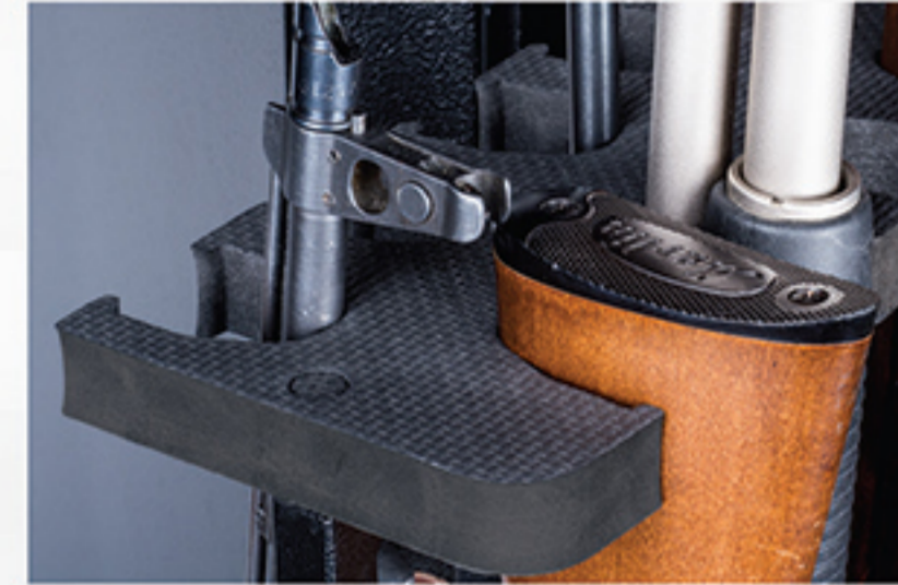
Long Guns Can Be Stored Barrel Up or Down to Fit More Scoped Weapons