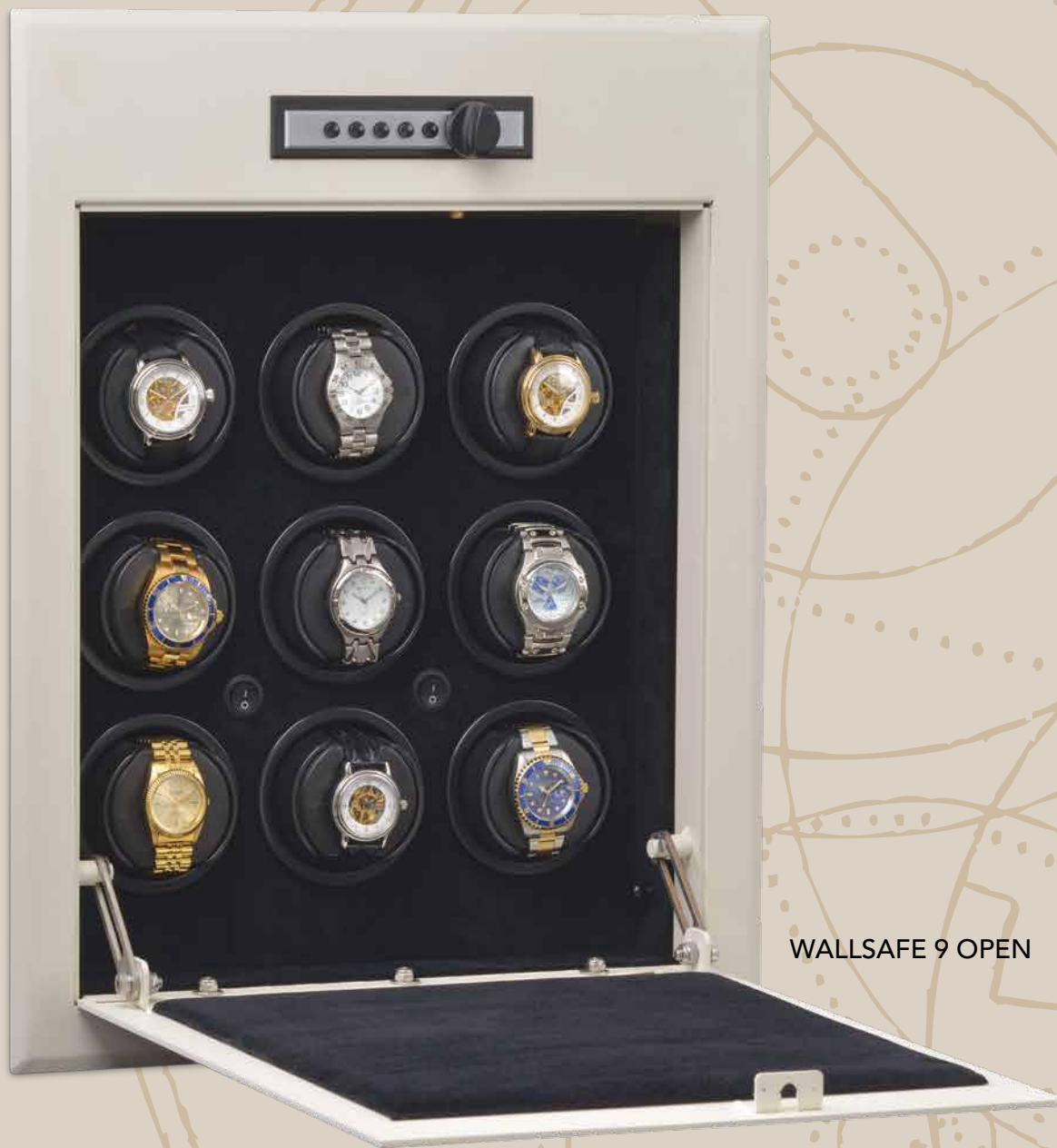
WALLSAFE 9 OPEN

The WallSafe is designed for quick and easy installation between 16" on center wall studs (2x4 or 2x6). When the WallSafe is mounted in walls with studs, trim or filler strips between the wall and the frame flanges may be required to assure an attractive installation.