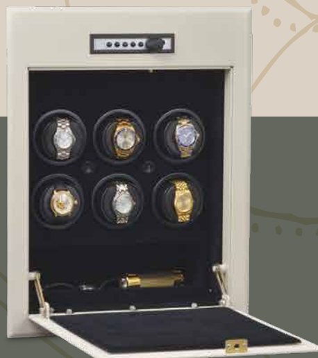
WALLSAFE 6 OPEN