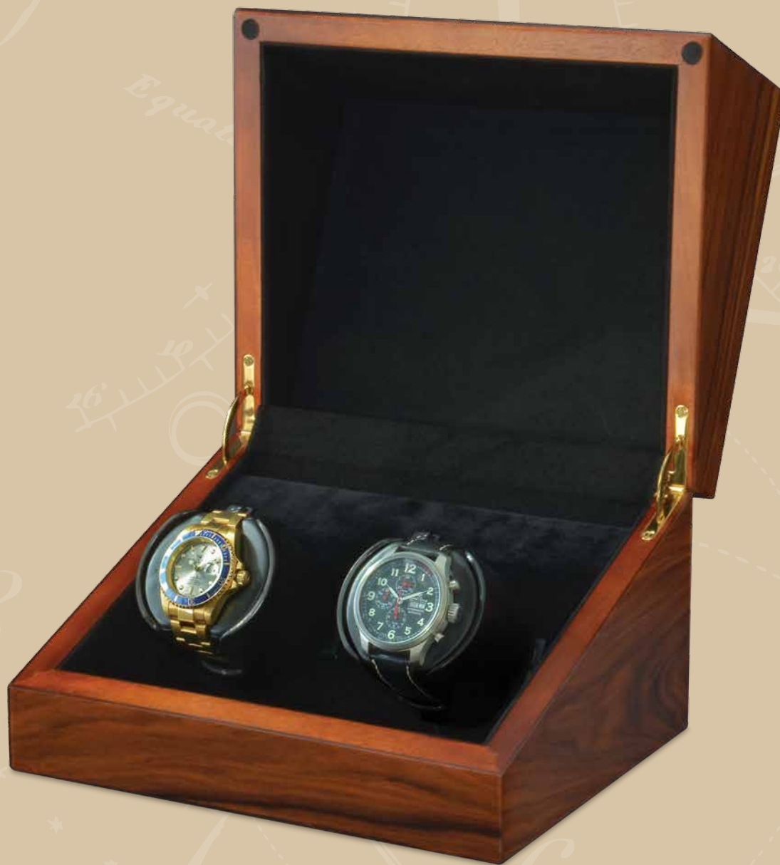
SPARTA DELUXE 2 TEAK

Back by popular demand, our Sparta Deluxe winders are housed in beautiful display cases. They are ideal for use in closets or on display with no need for a plug-in adapter. Equipped with Orbita long-lived lithium D cell batteries operating on the normal eight-minute winding cycle, the batteries will last for many years without the need for replacement. Even longer life may be accomplished by using the 12-minute or extended-winding cycle, which is easily selected using the toggle switch located behind the mounting cup. The Sparta Deluxe is available in stylish Teak or Burl wood grained finish.