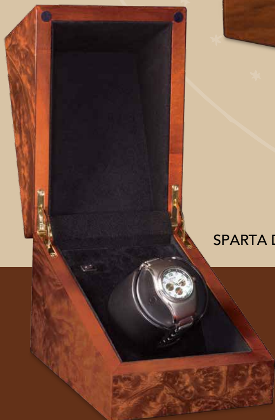
SPARTA DELUXE 1 BURL