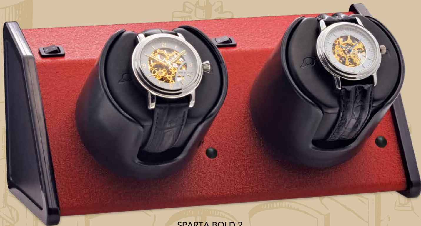
SPARTA BOLD 2

A new spin on a classic style. These entry level winders are compact and lightweight. They are ideal for use in safes without the need for a plug-in adapter. Equipped with Orbita long-lived lithium D cell batteries, operation on the normal eight-minute winding cycle, the batteries will last for many years without the need for replacement. Even longer life may be accomplished by using the 12-minute extended-winding cycle, which is easily selected using the toggle switch located behind the mounting cup. The Sparta Bold is available in several powder coated finishes.