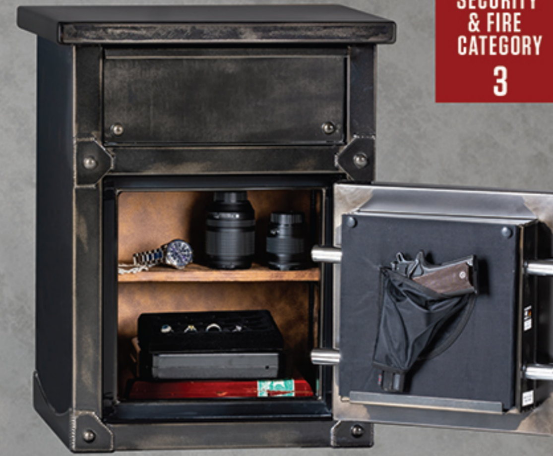
Model LNS2618 Nightstand / End Table Safe