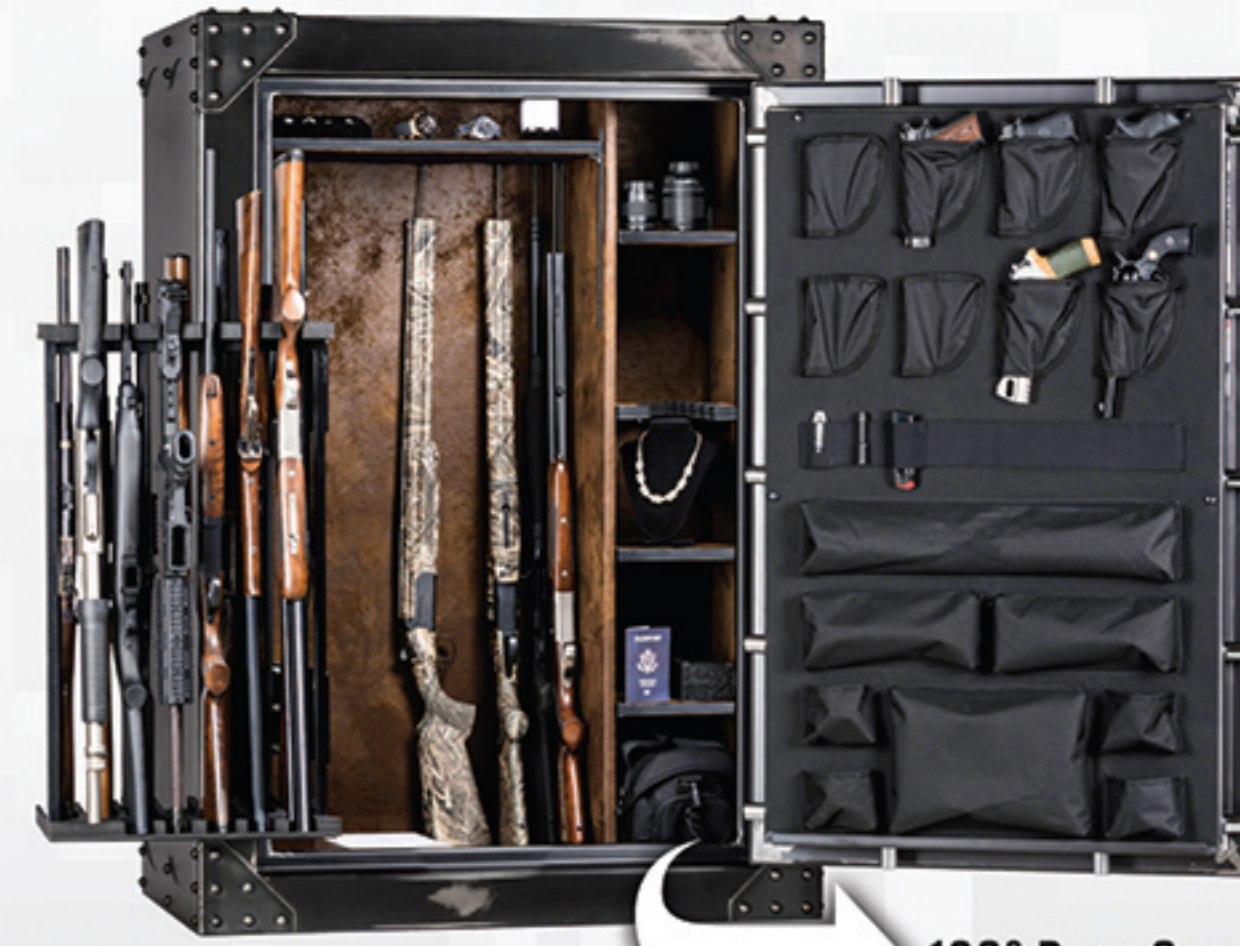
180° Door Opening

Rhino Metals. . . everything else is just storage.