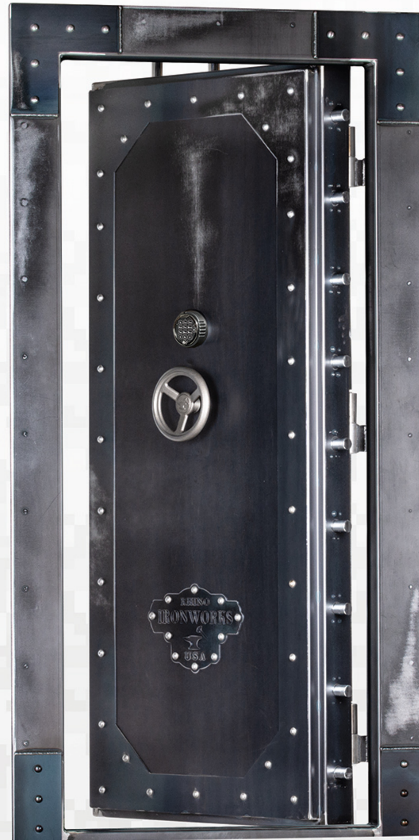
Model IWVD8240 In-Swing Standard Hinge Shown. Available in Reverse Upgrade Shown: U.L. Listed Electronic Lock