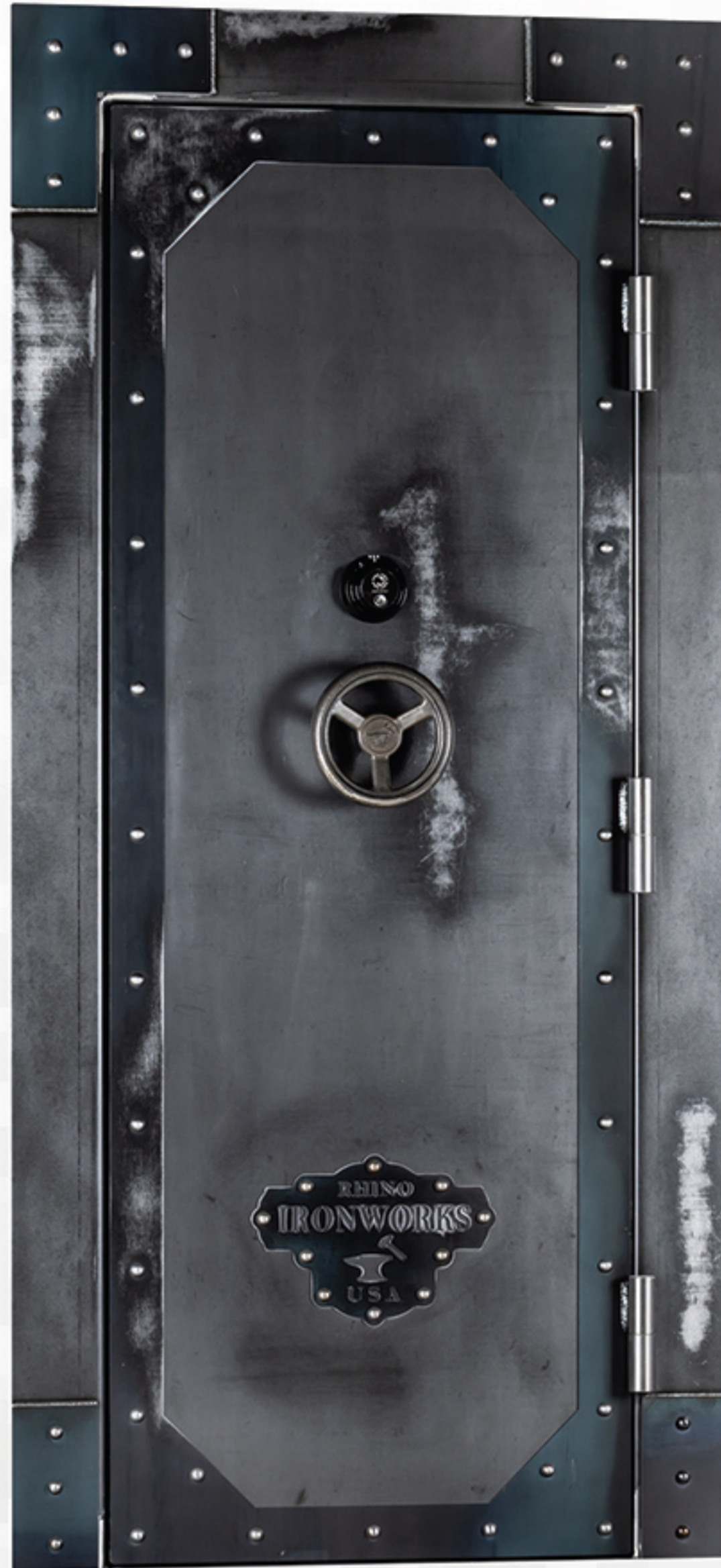
Model IWVD8030 Out-Swing Standard Hinge Shown. Available in Reverse