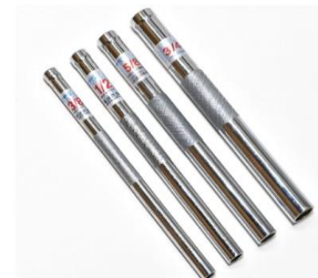
Anchoring punch (We do not supply it)