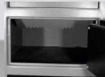
Baffling Protecting Deposits