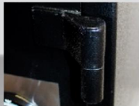
Extra Heavy Duty Hinge