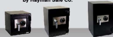
CV 14 C CV 20 C CV 27 C

CASH VAULTS are available with Key, Combination or Electronic Locks (K, C, E) as indicated in the part numbers.