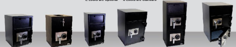
CV F20C CV H20C CV F27C CV F30WC CV F32-2EC CV F30W-2CC

E Locks are Optional • C Locks are Standard