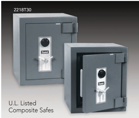
U.L. Listed Composite Safes

Gardall Safe Corporation has been manufacturing premium quality safes for home and office applications since 1950. Our Commercial High Security safes are manufactured to specifications which are more stringent than many of our competitors requirements. Some of the standard features on Gardall TL15 and TL30 safes are options with other manufacturers. Please be sure to compare our specifications with those of our competitors before making your decision.