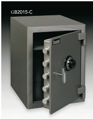
Five massive 1/4" bolts in boltwork