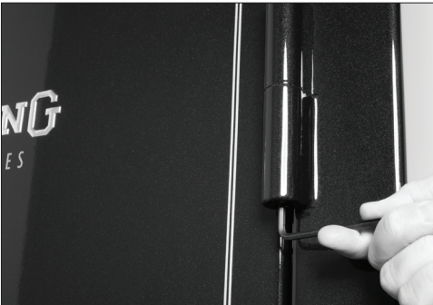
Use an Allen wrench to adjust the door height.

the Allen bolt counterclockwise (looking down at the hinge) raises the door on its hinges. Both Allen bolts (top and bottom hinges) should be turned the same amount when adjusting the door.