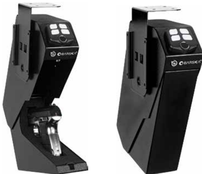
Pistol Keypad Biometric Safe AX13092

Features a matte black textured finish which will not call attention to its presence. It is the ideal choice for a home or business looking for added security. This desk safe includes a mounting bracket that can easily be mounted to the right or left side. A discrete silent access mode allows the user to access the firearm within without alerting anyone. Includes back up keys that will override the lock and open the pistol safe.