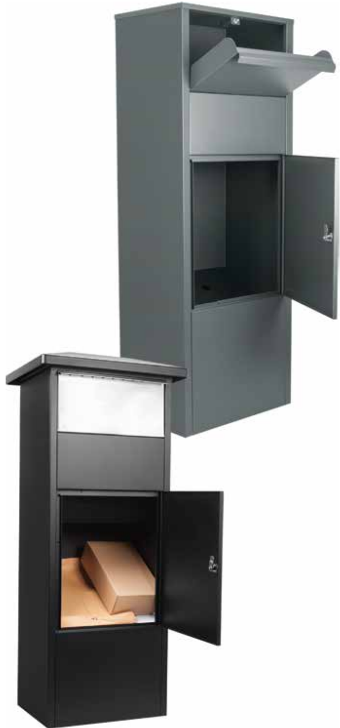
MPB-500 Parcel Mail Box, Black w/Drop Door