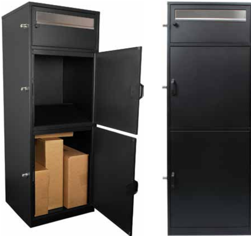
MPCB-100 Multi-Chambered Mail and Parcel Box With Adjustable Space CB13610