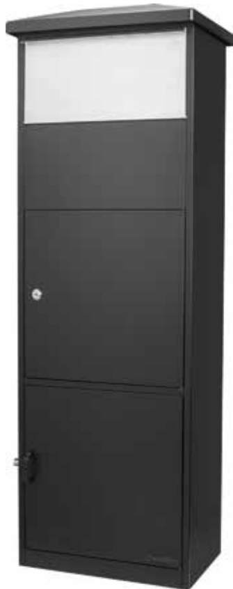
MPB-600 Parcel Mail Box, Black, w/One Big Parcel, Drop Door