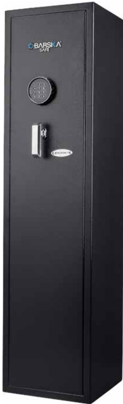
4.33 Cubic Ft Keypad Rifle Safe AX13100