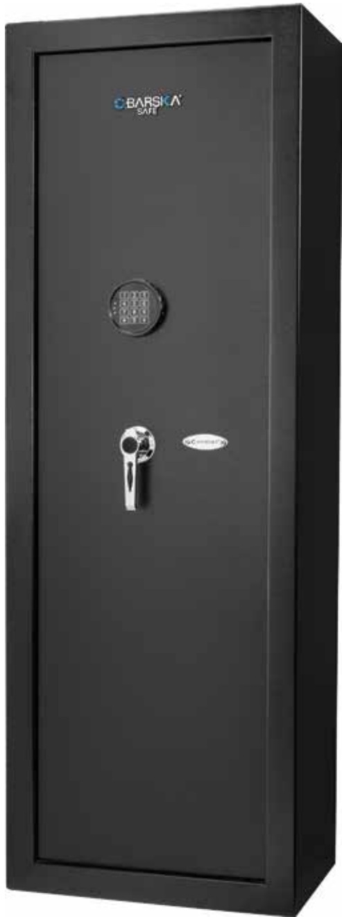
7.87 Cubic Ft Keypad Rifle Safe AX13328