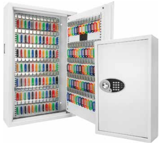
144 Keys Keypad Wall Key Safe AX12660