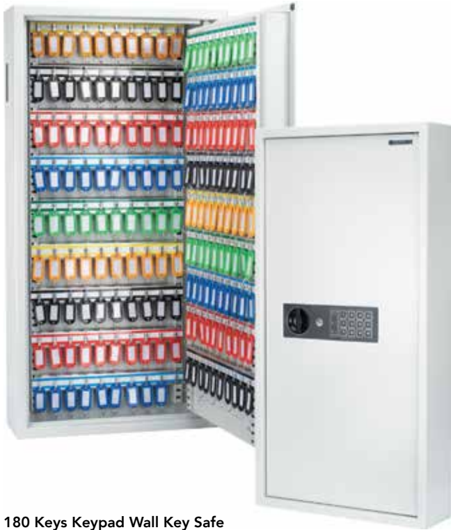
180 Keys Keypad Wall Key Safe AX13350