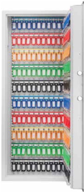
240 Keys Keypad Wall Key Safe AX13368