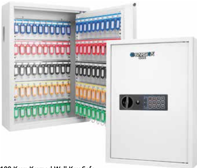
100 Keys Keypad Wall Key Safe AX13262