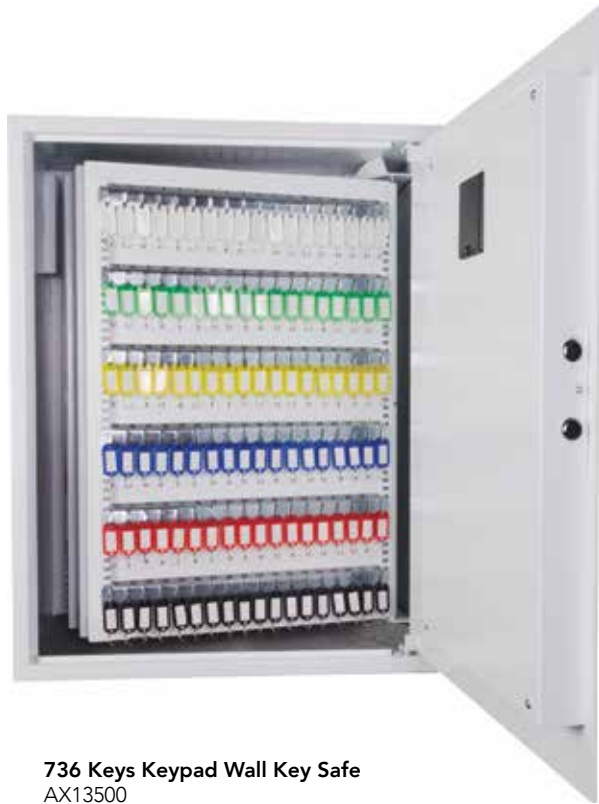
736 Keys Keypad Wall Key Safe AX13500