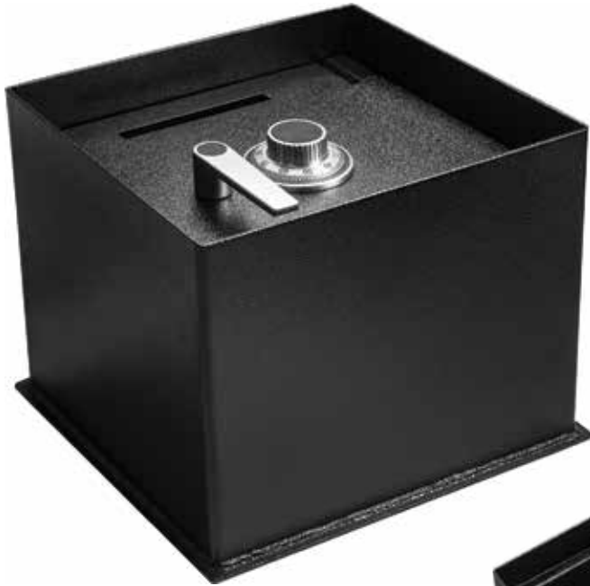
0.89 Cubic Ft Floor Safe AX13200

A discreet way of storing valuables and important belongings. This solid steel Floor Safe fits easily between the joists underneath most floorboards. The Floor Safe sits level with the surrounding surface, allowing it to be covered by other items such as a rug. Ample storage space provides enough room to secure important items such as money, jewelry, compact electronics, important documents, and much more.