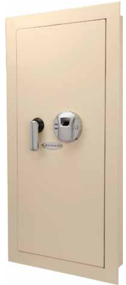
Contents Not Included