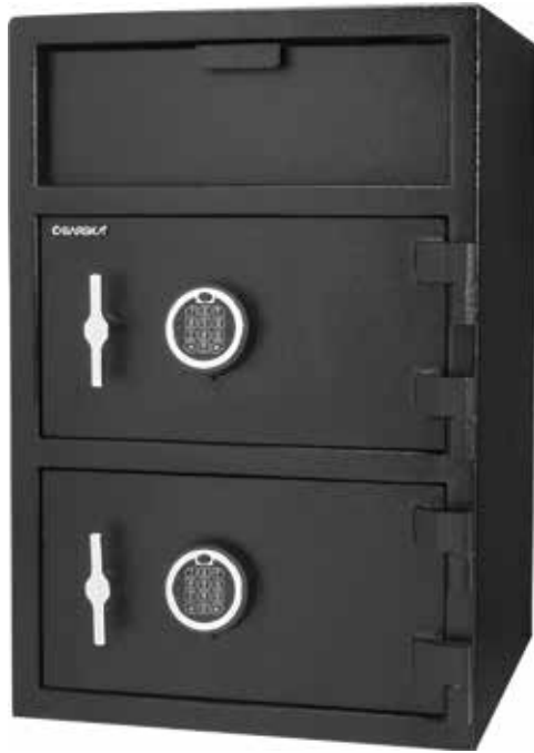
1.6/2 Cubic Ft Two Lock Keypad Depository Safe AX13312