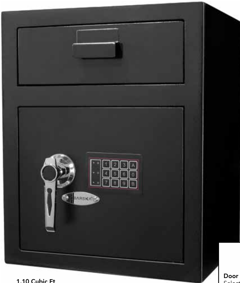
1.10 Cubic Ft Keypad Depository Safe AX11930