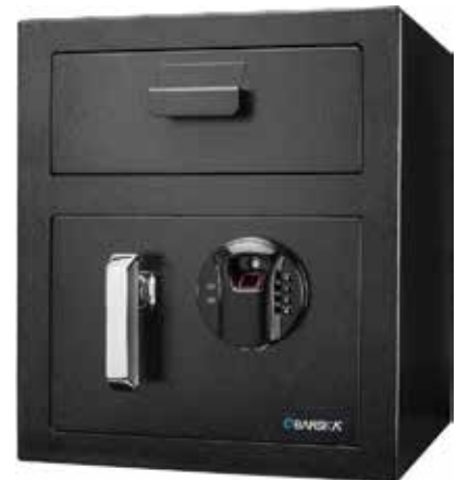
0.72 Cubic Ft Biometric Keypad Depository Safe AX13108