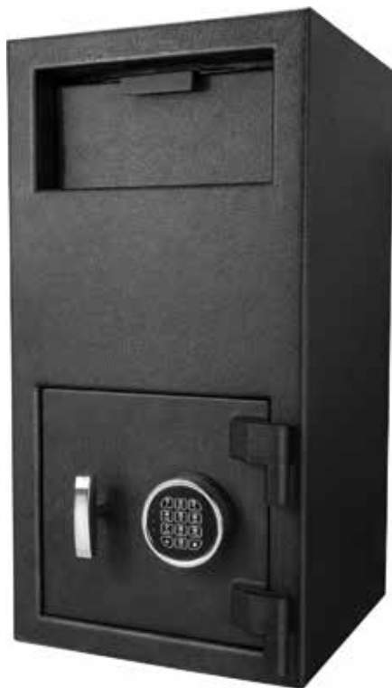
1.72 Cubic Ft Keypad Depository Safe AX12590

To prevent someone from fishing out money or deposit bags with a tool or a coat hanger being fished back out.