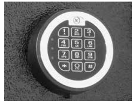
Keypad Lock Retains One Master Code and Five User Codes