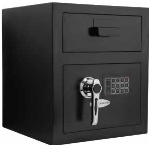
0.72 Cubic Ft Keypad Depository Safe AX11932

Select models features a large door drop slot for bulky items such as coin bags.