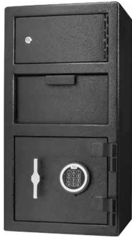
0.72/0.78 Cubic Ft Locker Keypad Depository Safe AX13310