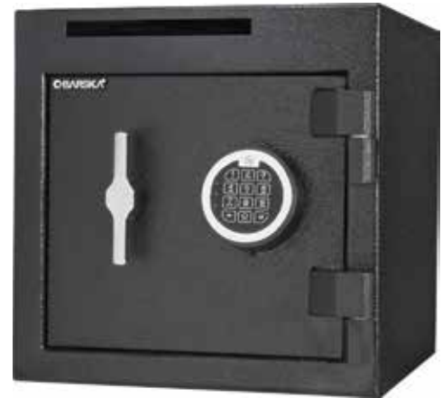
1.12 Cubic Ft Slot Keypad Depository Safe AX13314