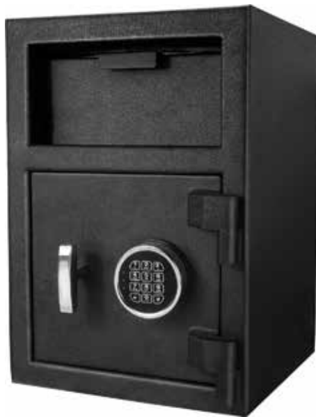
1.03 Cubic Ft Keypad Depository Safe AX12588